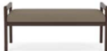
Enlarge Image + 2 Seat Bench #W1005B5