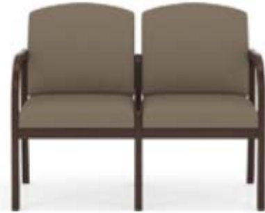
Enlarge Image + 2 Seat Sofa #W2301G5