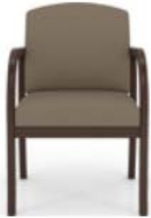
Enlarge Image + Guest Chair #W1301G5