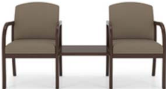
Enlarge Image + 2 Chairs w/Connecting Center Table #W2311G5