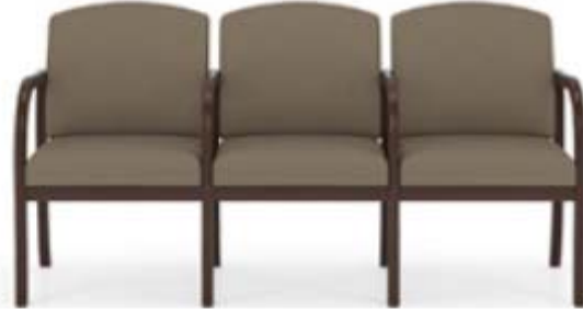
Enlarge Image + 3 Seats w/Center Arms #W3303G5