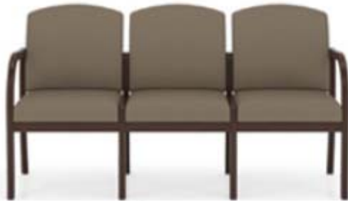
Enlarge Image + 3 Seat Sofa #W3301G5