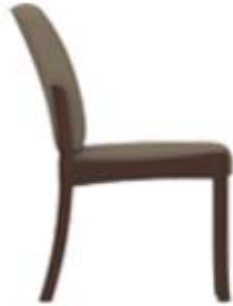
Enlarge Image + Guest Chair Armless #W1302G5