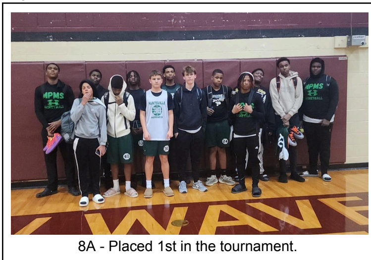
8A - Placed 1st in the tournament.