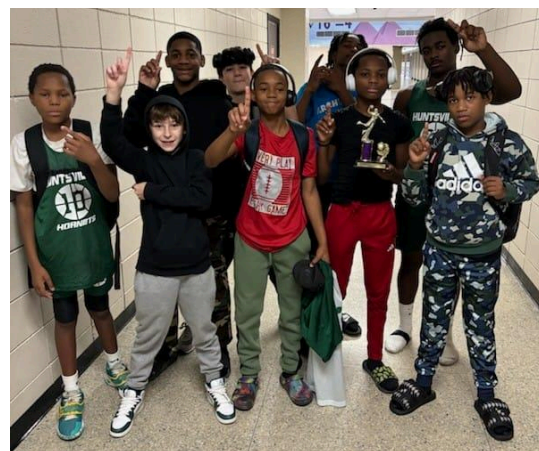
7A - Placed 3rd in the tournament.

Community Service: Beautiful holiday and get well cards for the local nursing home. Thank you, Photojournalism and Yearbook students, for this wonderful community service project.