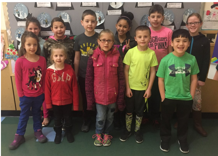
January student of the month winners!