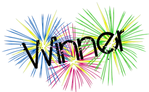
February student of the month winners!