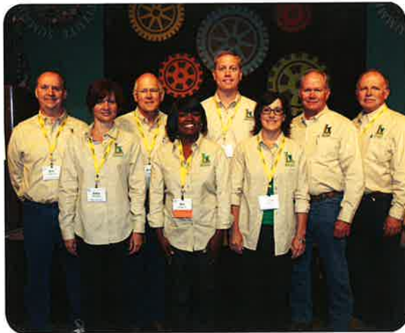
Lexington ISD Leadership Team

Let everyone in your community know what serving on the school board is all about, and show them what you are doing to learn more about public education and leadership to benefit the schoolchildren in your area.