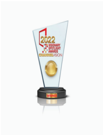
2022 Visionary Spotlight Award