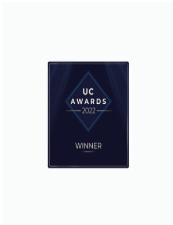
UC Awards 2022 for Best Endpoint Product