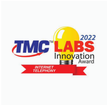
2022 TMC Internet Telephony Innovation Award