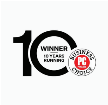
2023 Business Choice Award

We are proud to be recognized for our innovation, service and leadership from industry analysts, influencers, partners and most importantly, from our customers. See some of our recent achievements below.