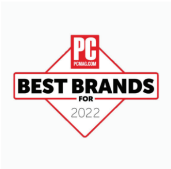
Best Tech Brands for 2022