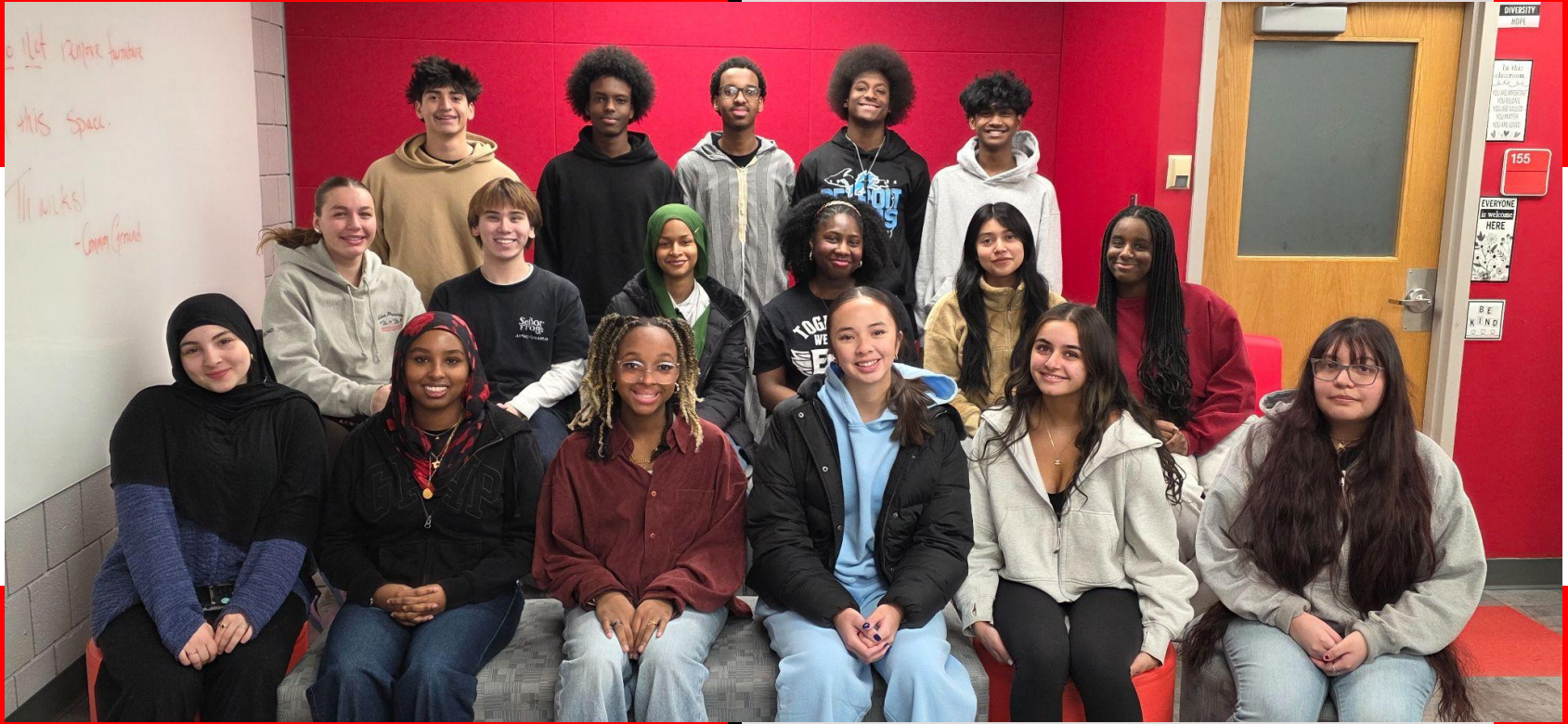
Unity Advisory Council 2025 - 2026 *Not all members present