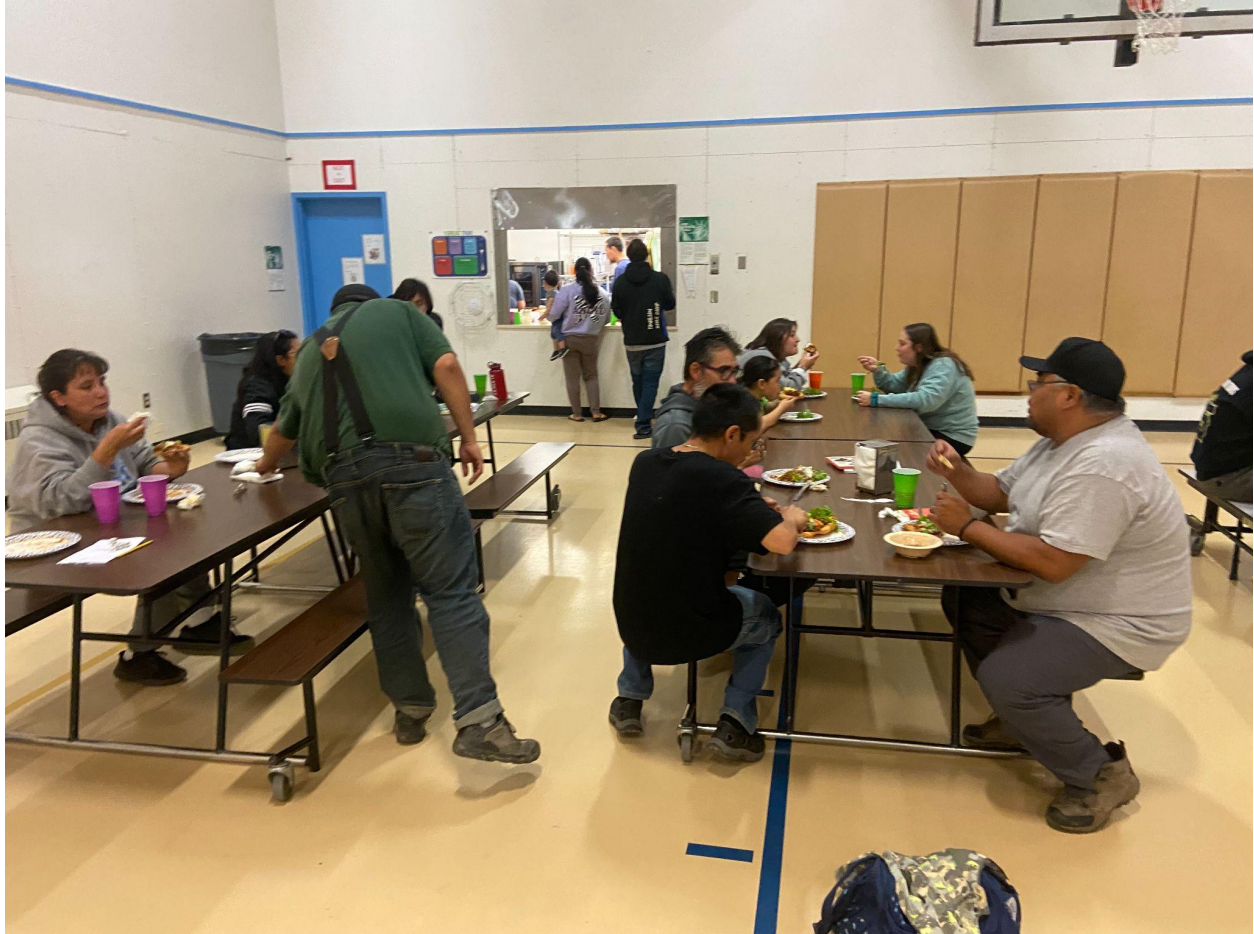
Parents, staff and students enjoy the meal and conversation.