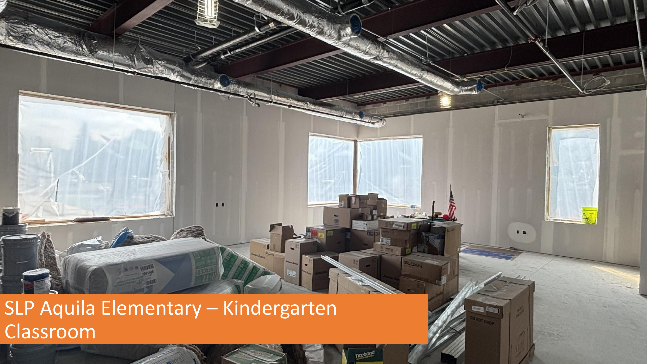
SLP Aquila Elementary – Kindergarten Classroom