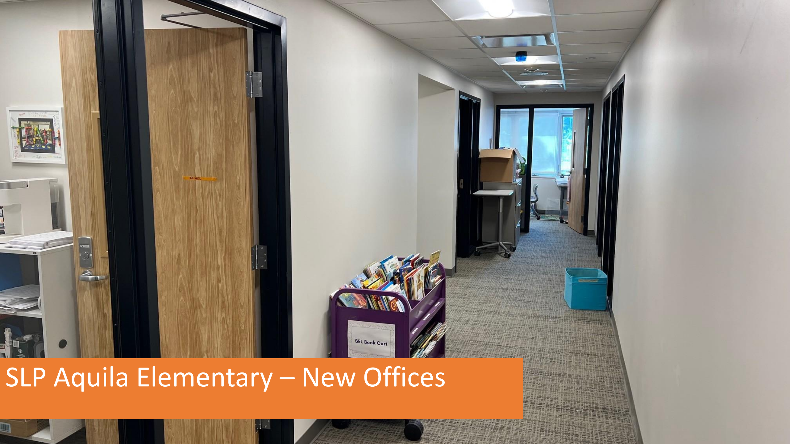
SLP Aquila Elementary – New Offices