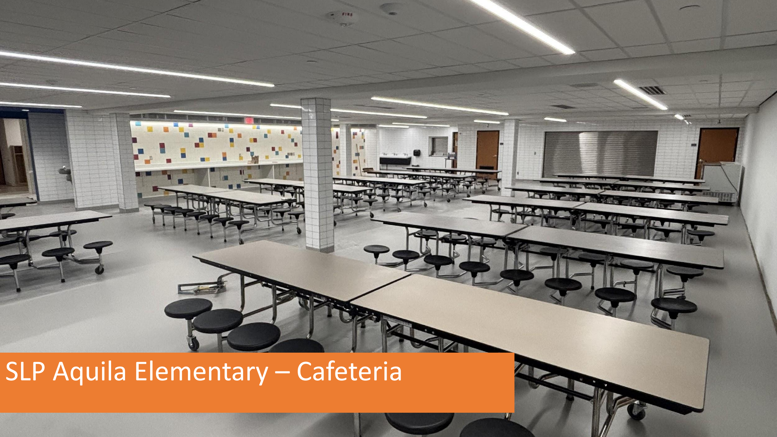
SLP Aquila Elementary – Cafeteria