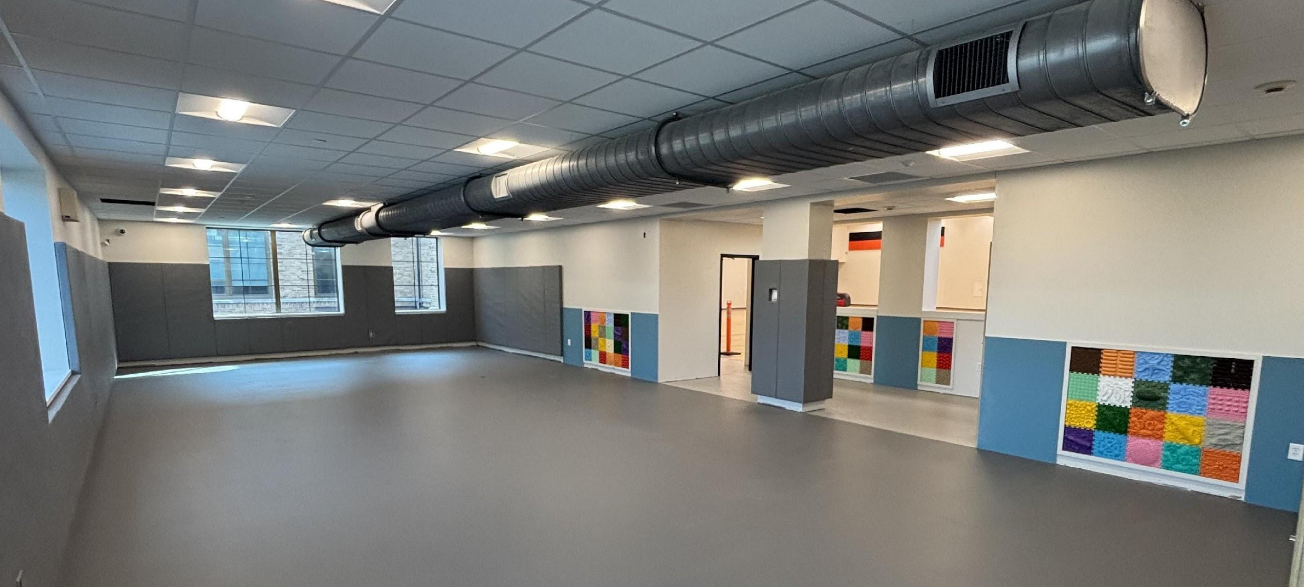
SLP Central Community Center – Annex Gym Area