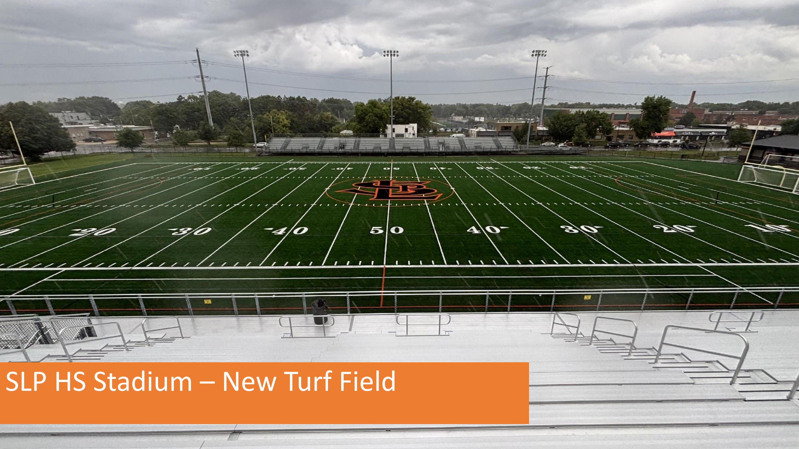
SLP HS Stadium – New Turf Field