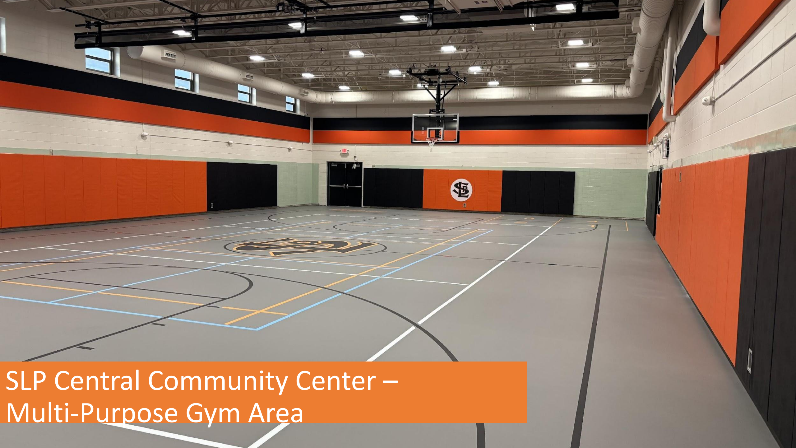
SLP Central Community Center – Multi-Purpose Gym Area