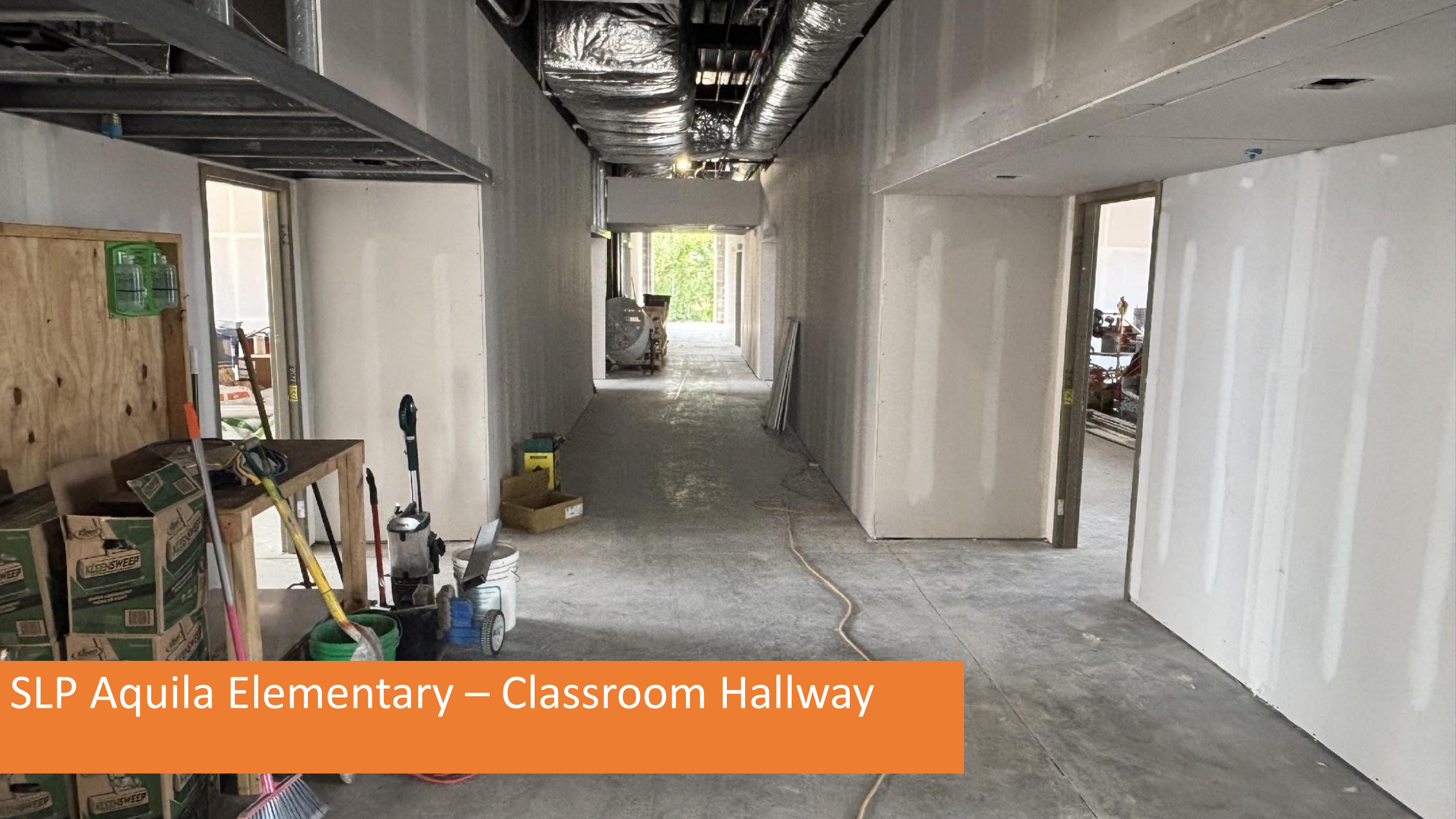
SLP Aquila Elementary – Classroom Hallway