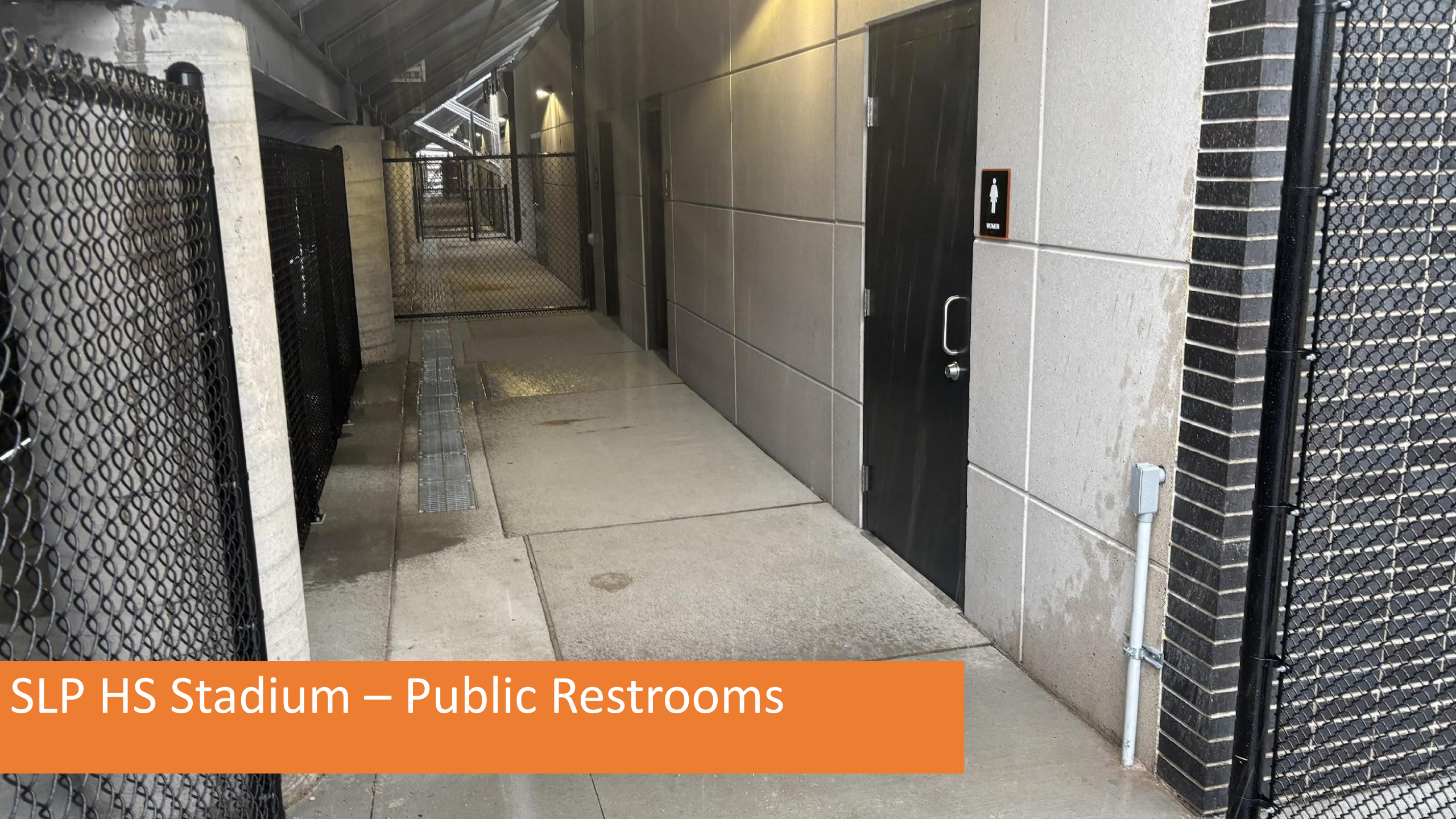
SLP HS Stadium – Public Restrooms