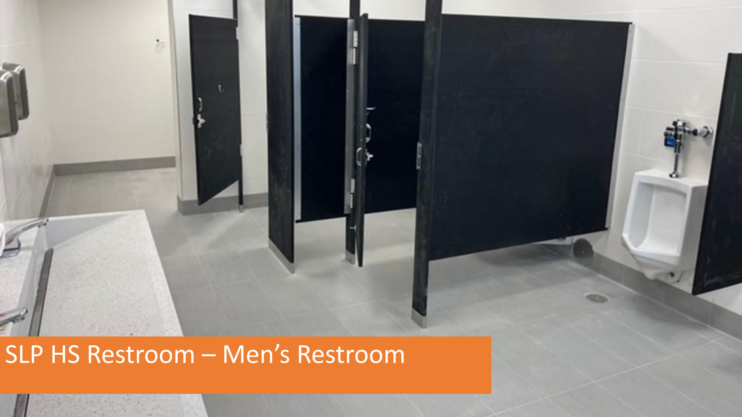
SLP HS Restroom – Men's Restroom