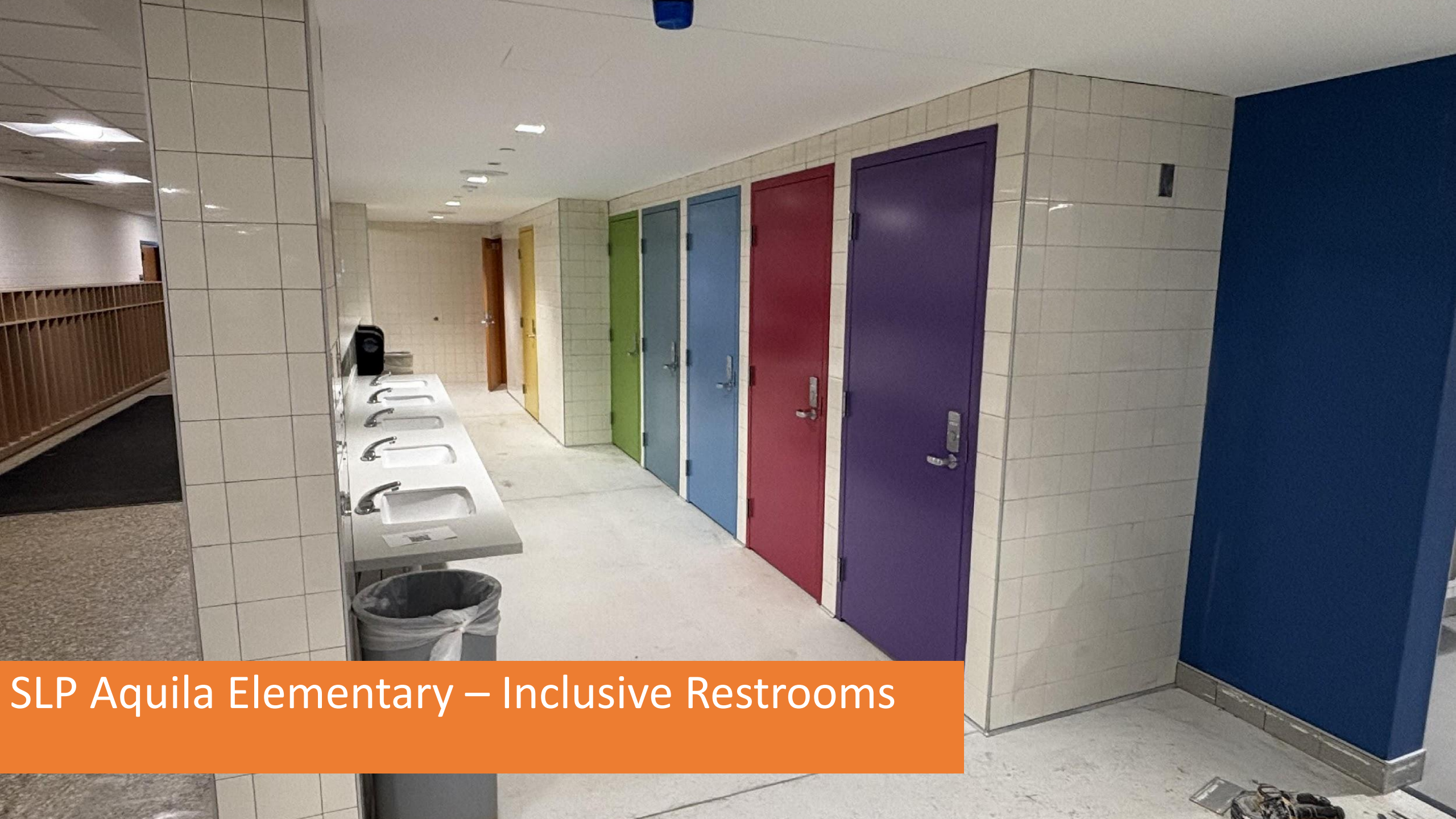
SLP Aquila Elementary – Inclusive Restrooms