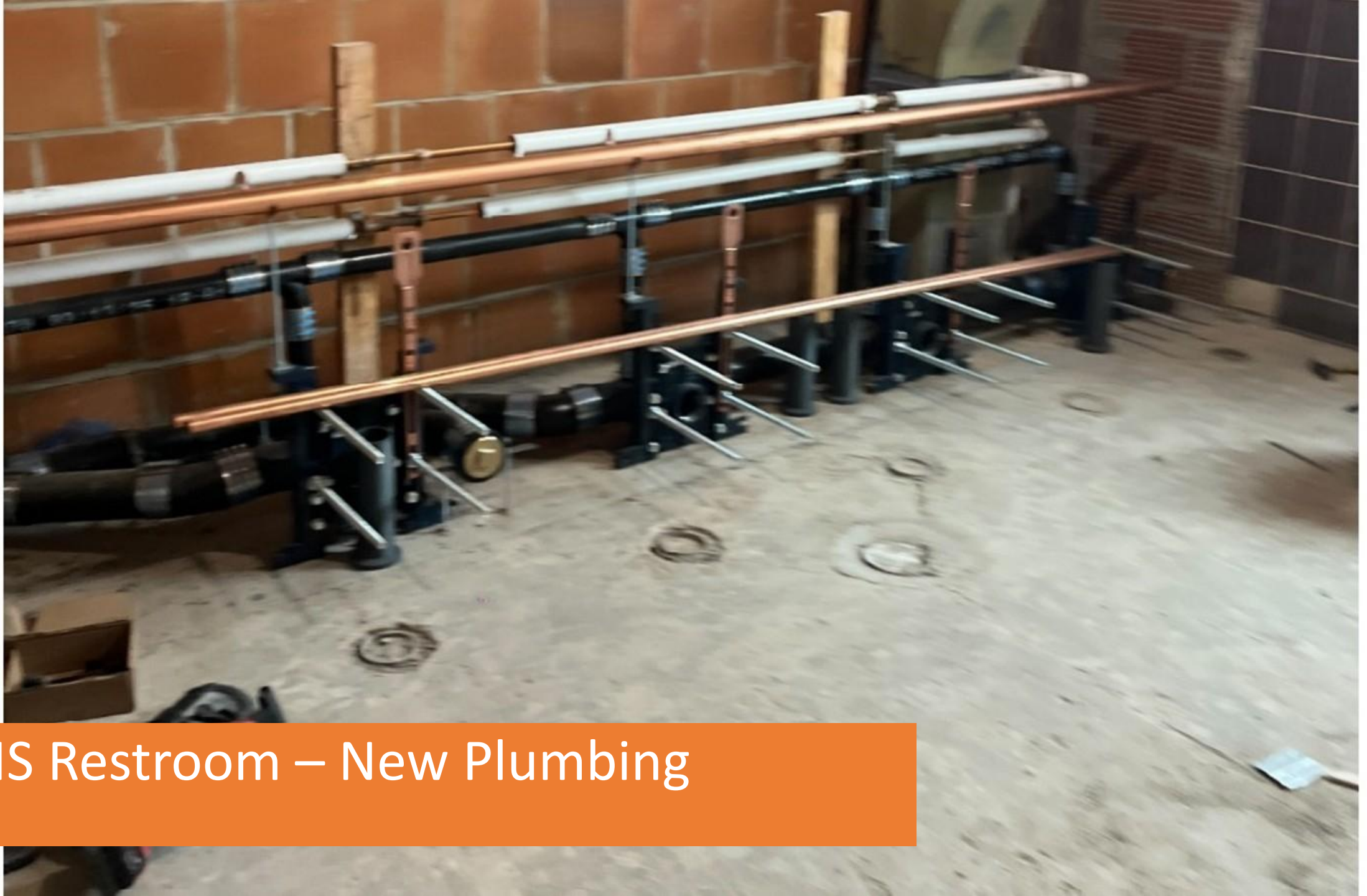
SLP HS Restroom – New Plumbing