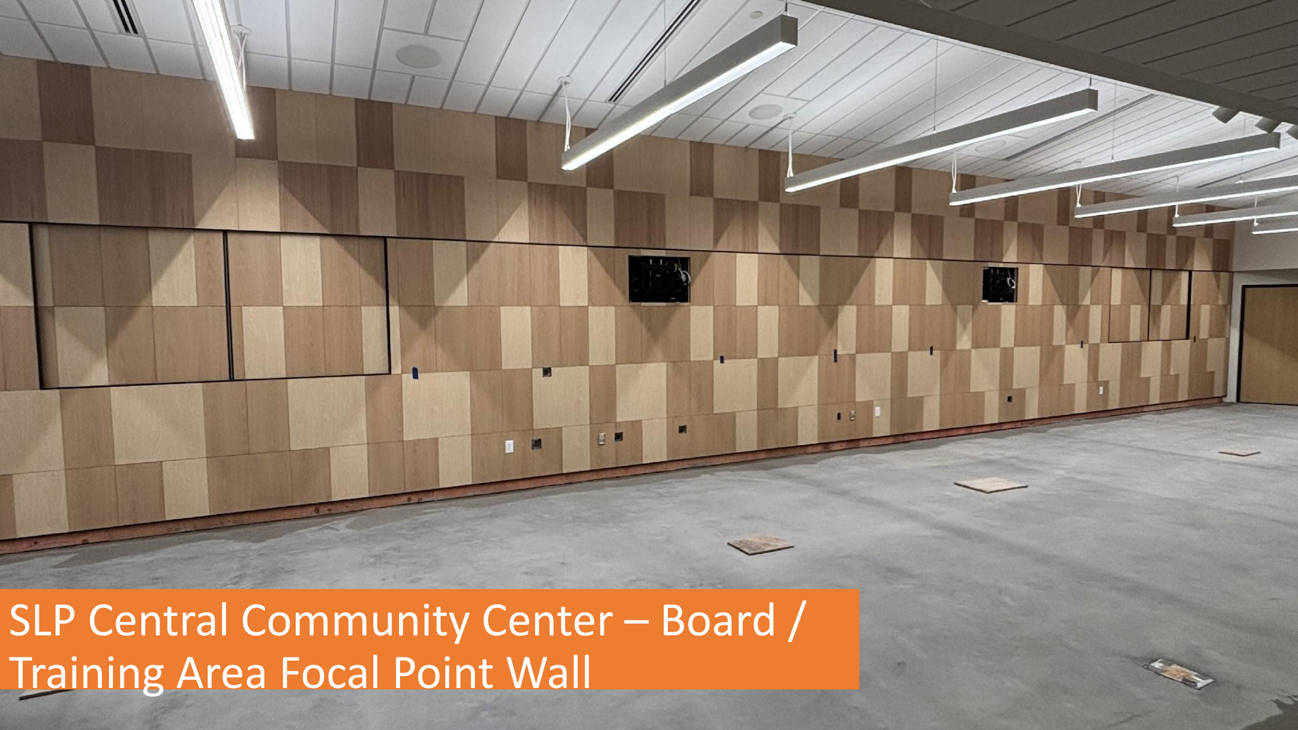
SLP Central Community Center – Board / Training Area Focal Point Wall