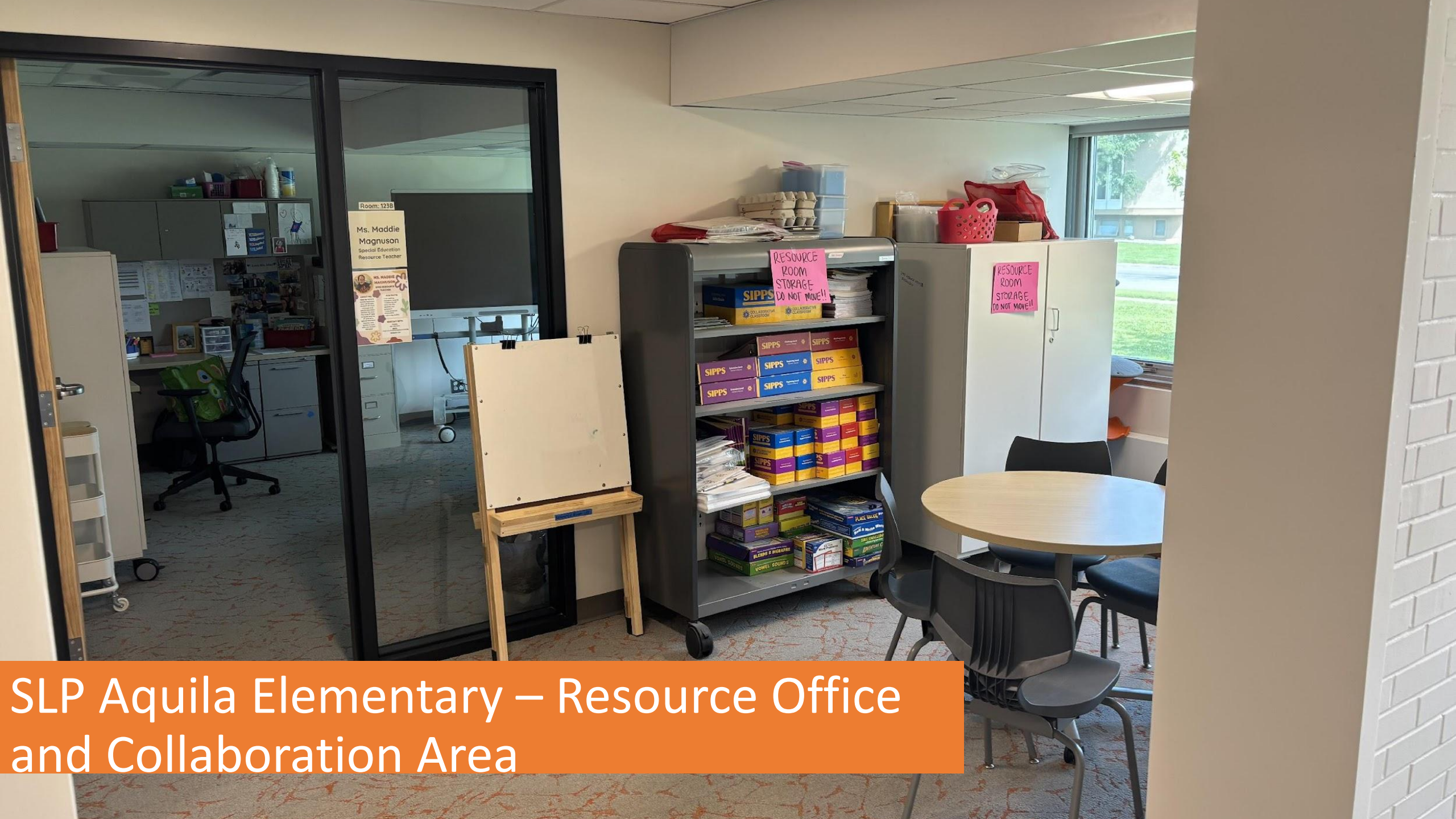
SLP Aquila Elementary – Resource Office and Collaboration Area