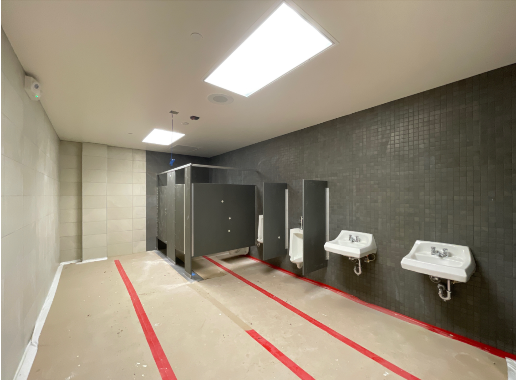
Classroom Wing Area A/A1