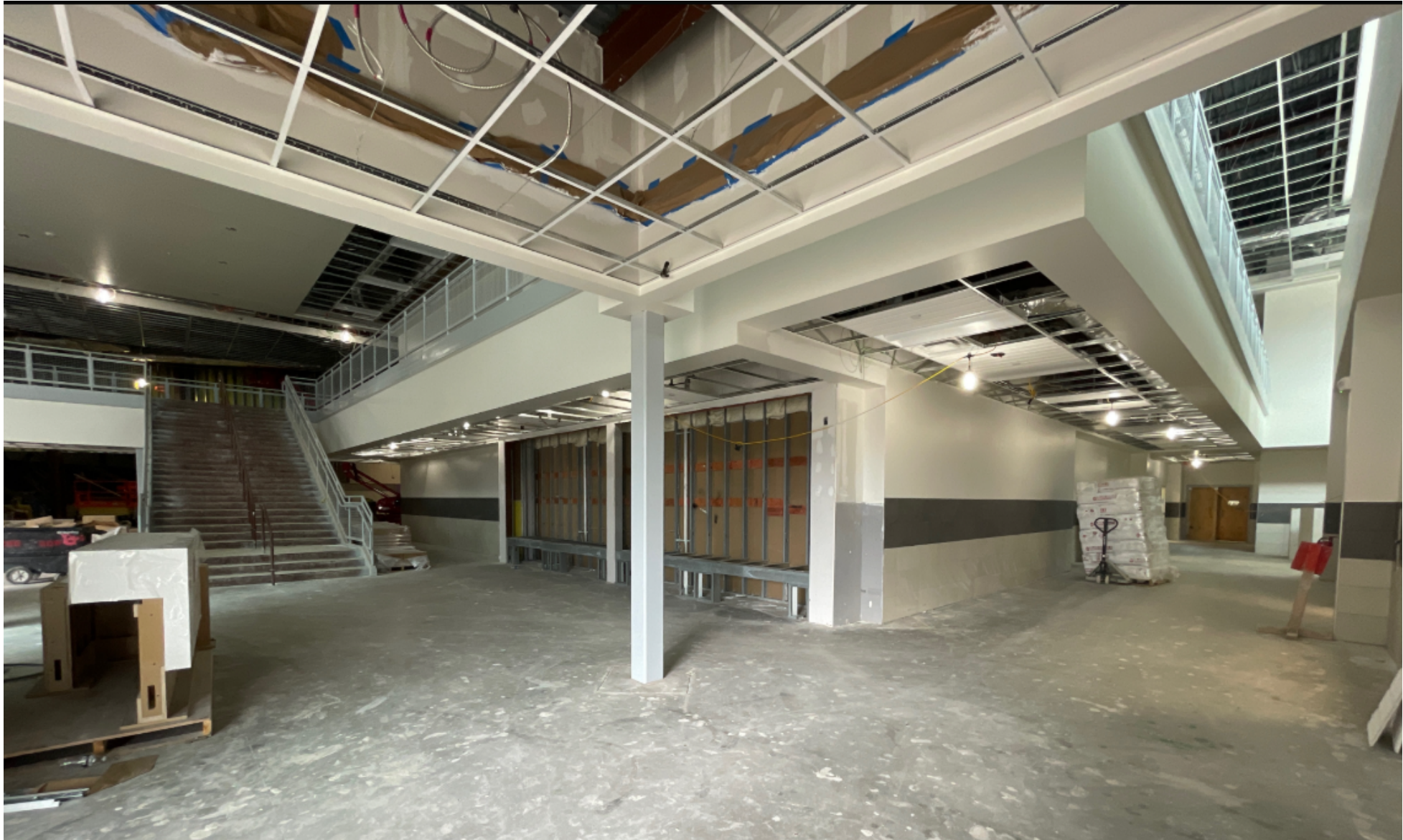
Area C Open Area