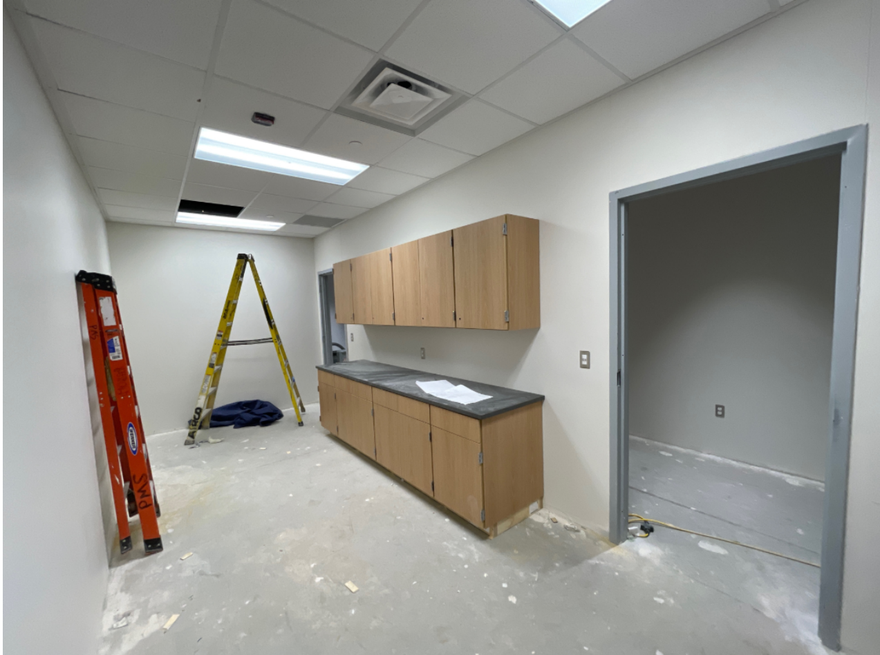
Area B Admin