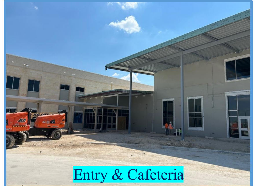
Entry & Cafeteria