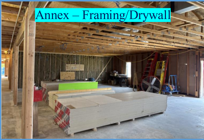
Annex – Framing/Drywall