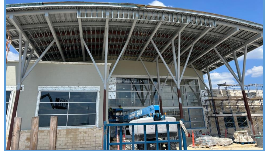
Front Reception as of 9/15/25