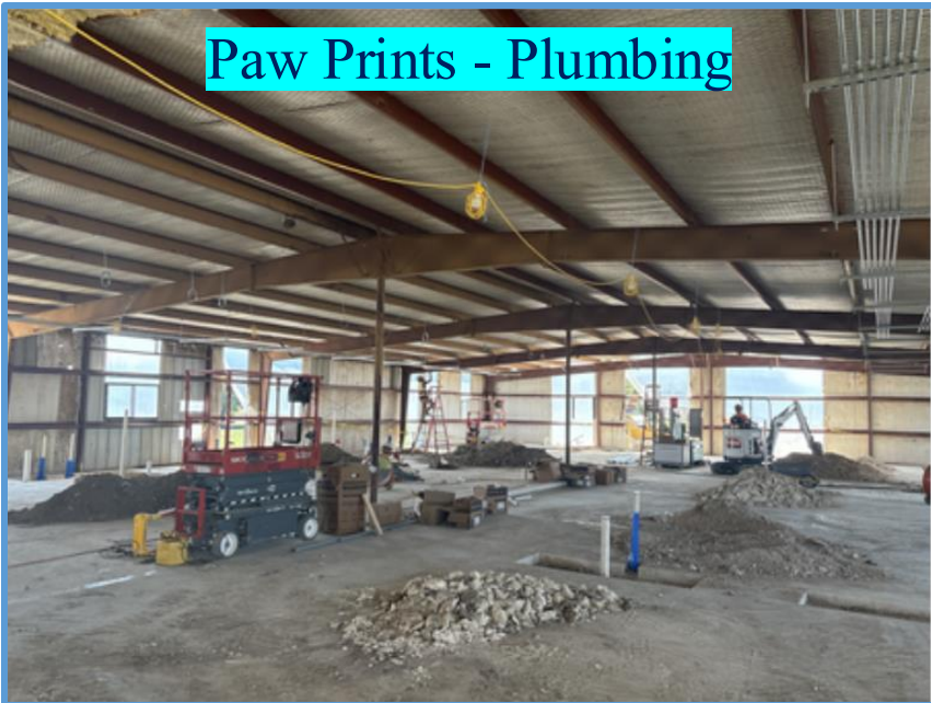
Paw Prints - Plumbing