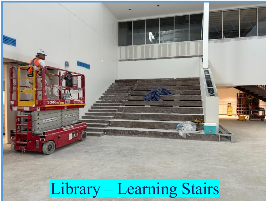
Library – Learning Stairs