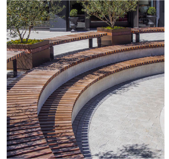
HARD SURFACE AMPHITHEATER