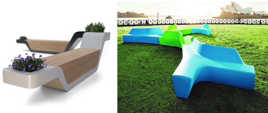
GROUND SURFACE ELEMENTS