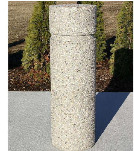
SECURITY BOLLARDS TO MATCH EXISTING