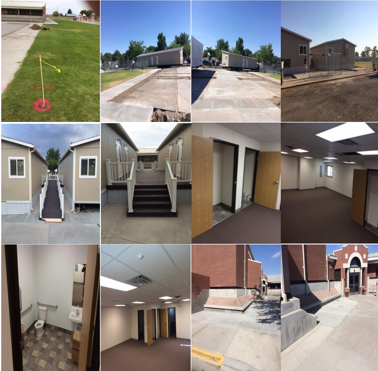
New sidewalk front entry

2) Modular classrooms. Board approved 2 28 x 68 modular classrooms. Taking steps to order and delivery by August 15, 2016. Layout attachments.