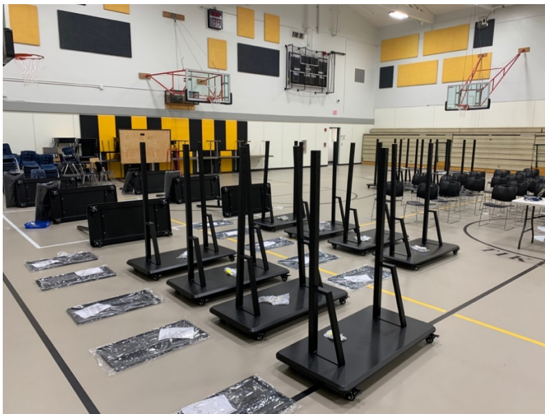
Interactive Board stands.