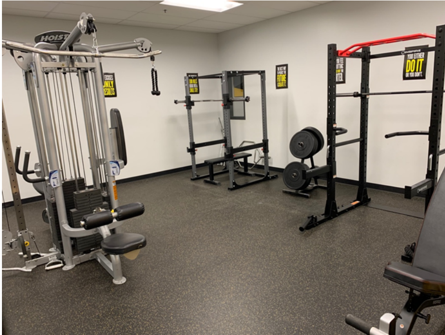
Weight Room equipment.