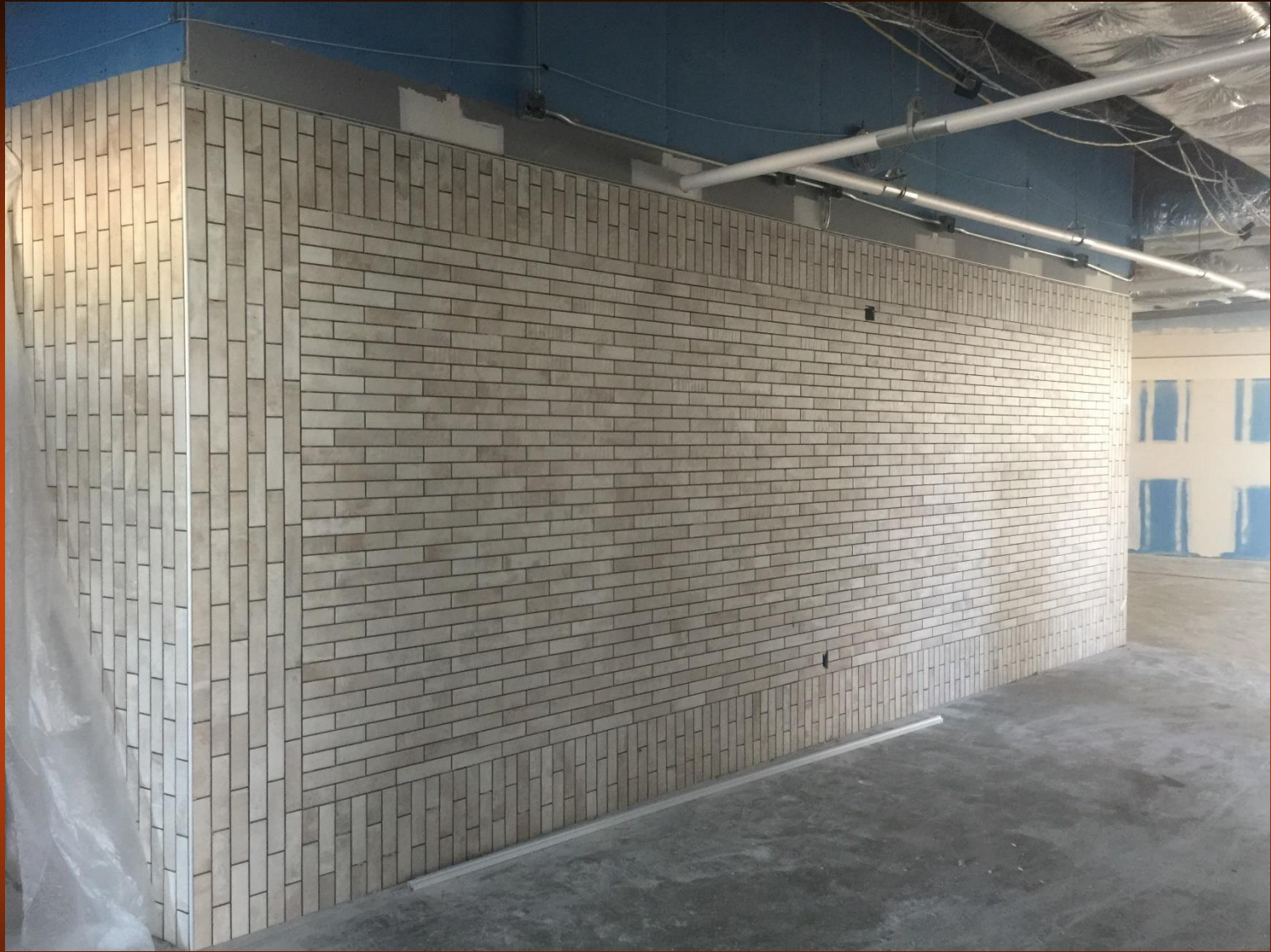
Walsh Elementary Tile Outside Gang Restrooms