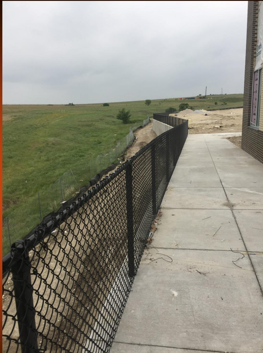
Walsh Elementary Fence at South Retaining Wall