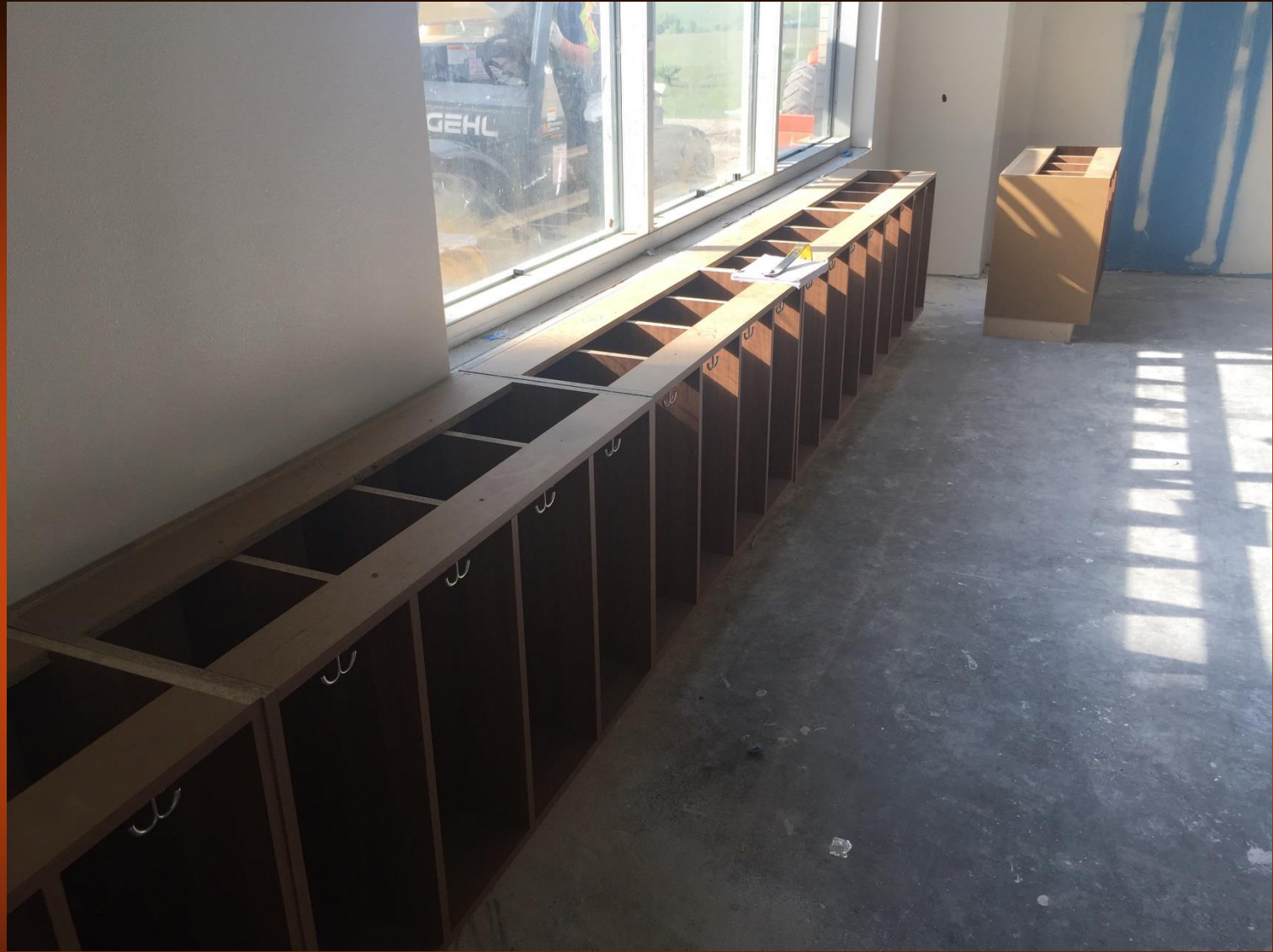
Walsh Elementary Starting Installation of Cabinets