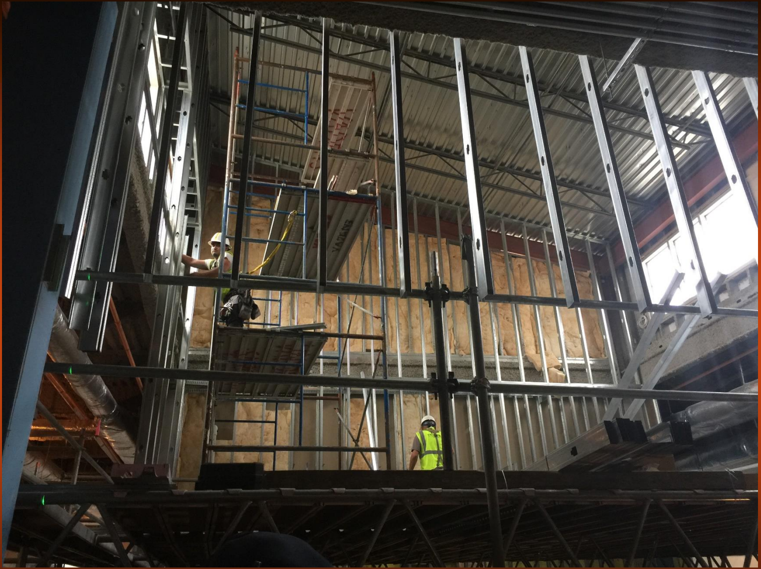
Walsh Elementary Framing Walls at Main Stair Clearstory