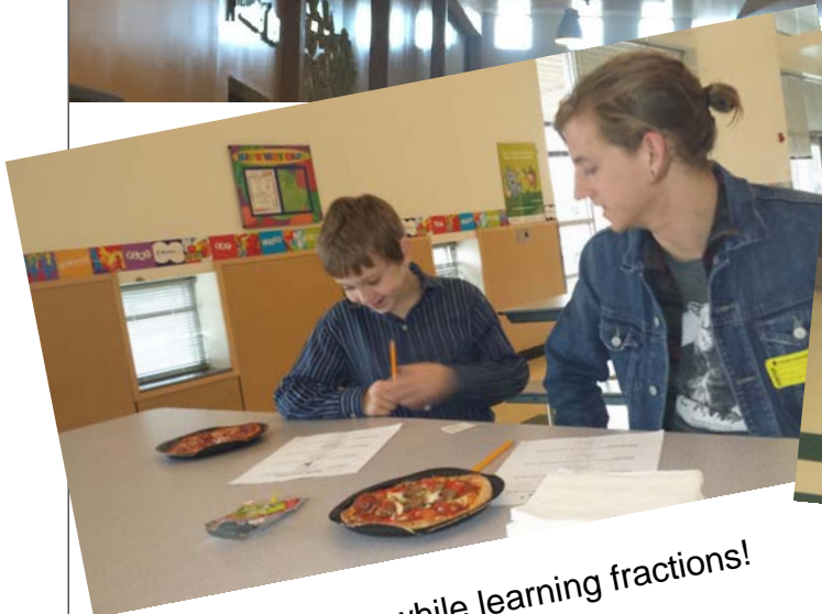
Making pizza while learning fractions!