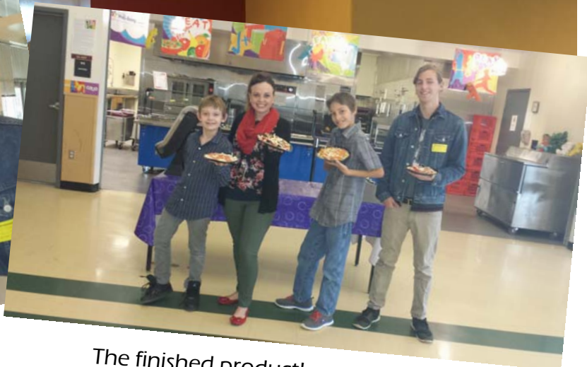
The finished product!