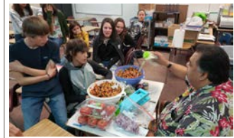
INDIGENOUS SALSA'S OF MIDWEST TRIBES