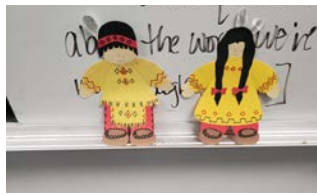
PAPER DOLLS: RIBBON SHIRTS AND SKIRTS

SOOKAPI STUDENTS ARE PASSING ALL CLASSES.