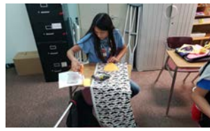
RIBBON SKIRT MAKING