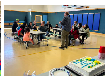
Cultural Visitor- Alutiiq Visors & Dance, Celebration of Thanks (LAK)