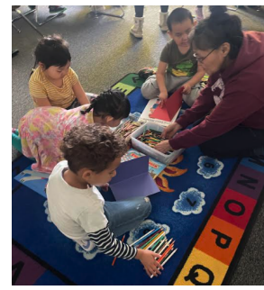
Thoughtful Cards for Elders (KHK)