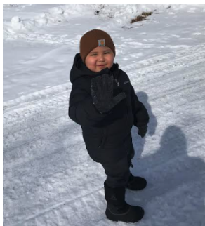
Outdoors & Sunshine (NON)