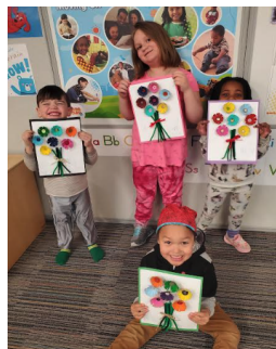
Spring Crafts (PTA)