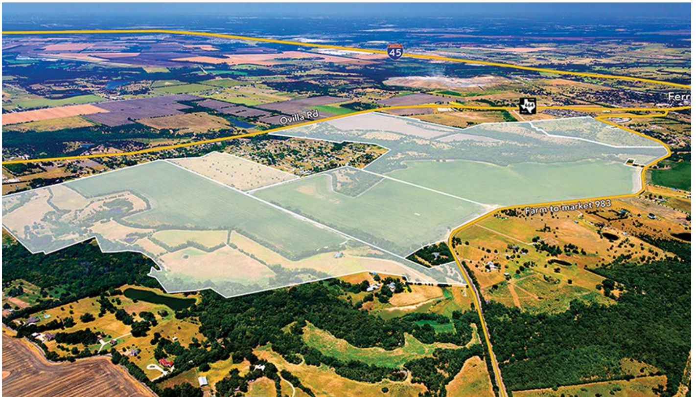
Bluff Springs will be near Interstate 45 in Ferris. (Walton )

D-FW home starts have soared in the past year, with almost 60,000 single-family houses under construction in the area.