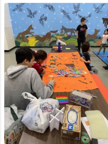
Students helping Prepare for the party