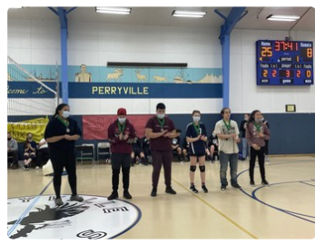
Lynx and Viking team up for the big win!