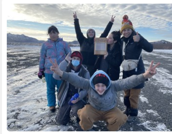
Volleyball 3 on 3 Champions!