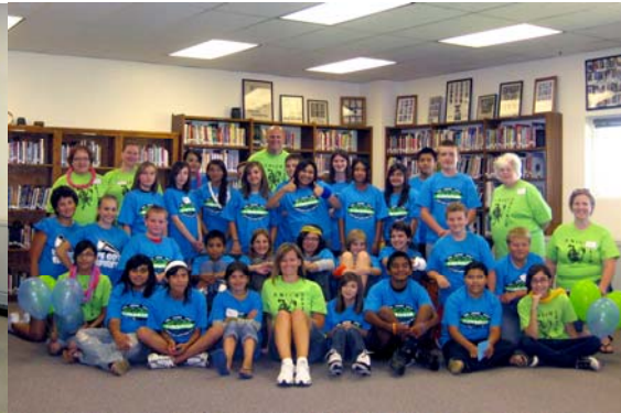
7 th Grade Fly-Up