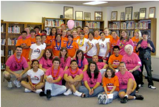
9 th Grade Fly-Up