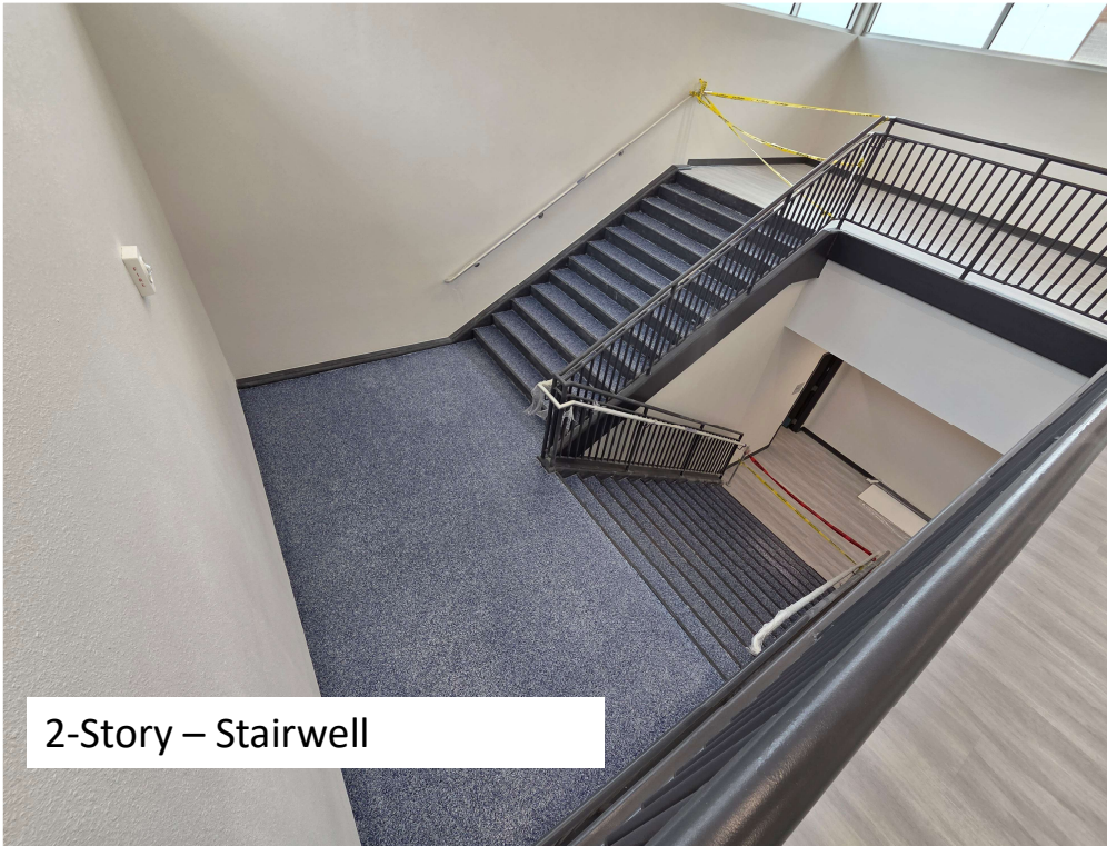
2-Story – Stairwell

Week of December 5 th – Intermediate School