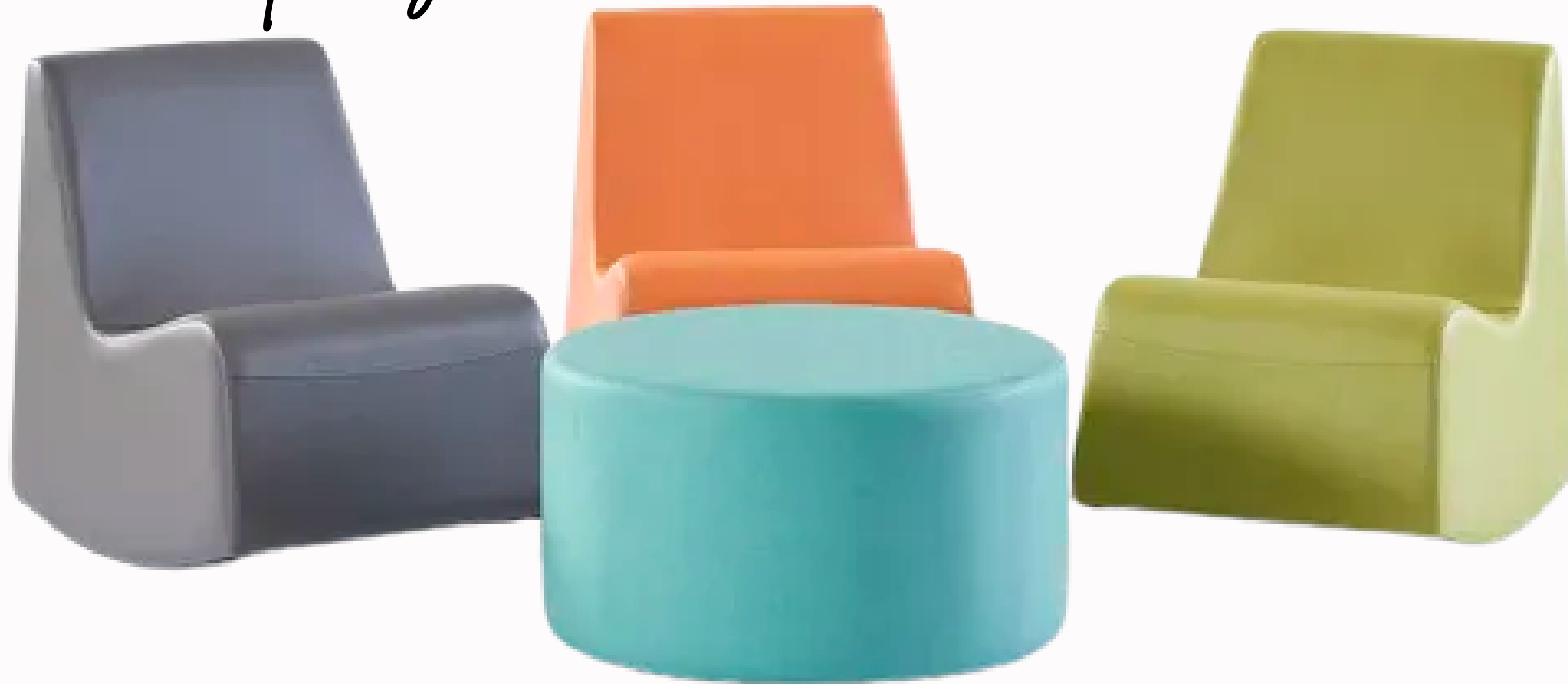
soft rockers & ottomans