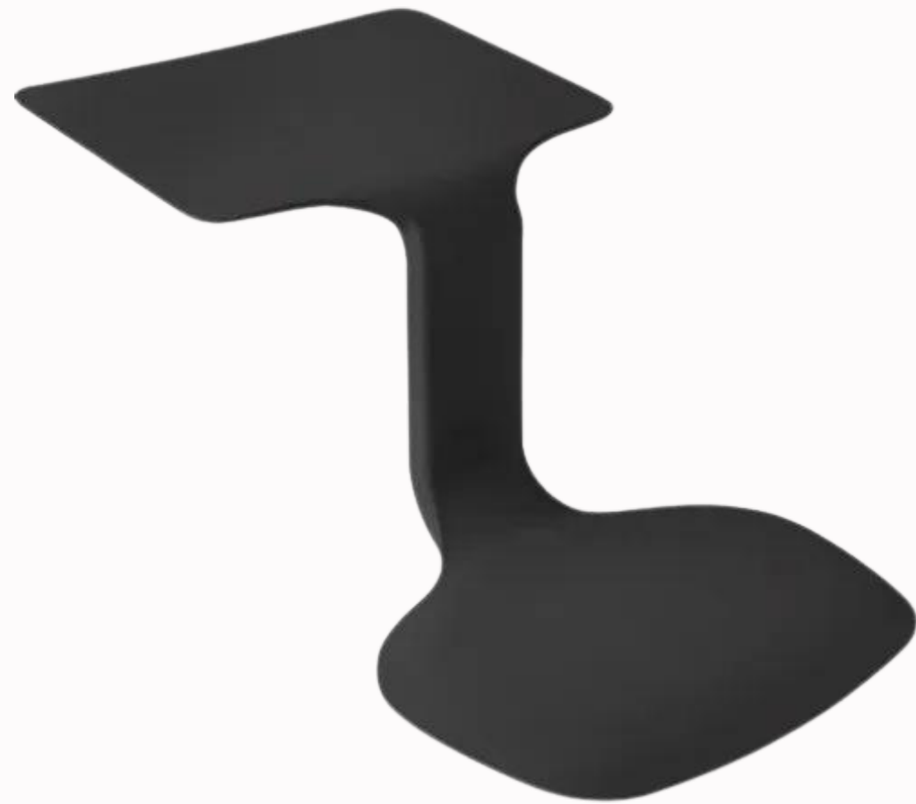
Surf portable work spaces