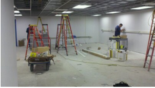
Computer Lab Finishes