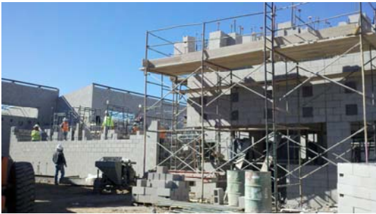
CMU Ext. Wall Installation

B. Rillito Center Addition: Construction is 35% complete. CMU exterior walls are being completed. Steel roof joists and roof decking are being installed. Interior MPE is ongoing. This project is on schedule and on budget.