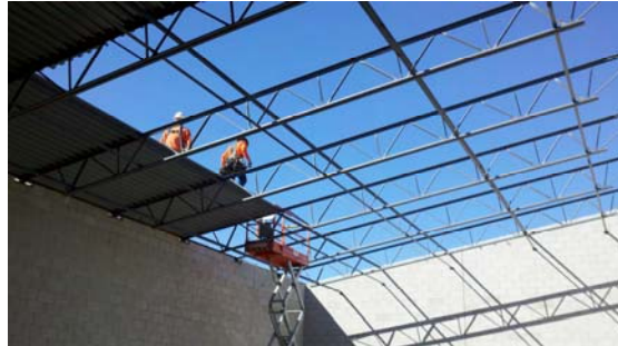
Roof Decking Installation

C. CDO Theater Updates: Construction is complete. This project was completed ahead of schedule and on budget.