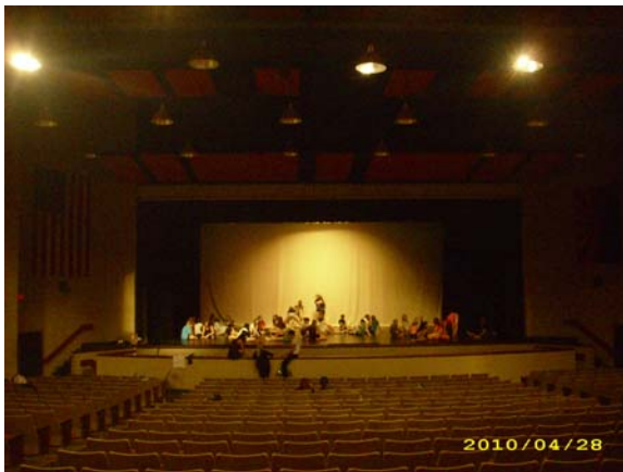
Stage Before Picture