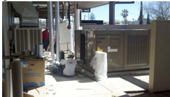
Mechanical Yard Connections

A. Coronado K-8 Classroom, Kitchen, and Fine Arts Addition / Remodel : Construction is 89% complete.