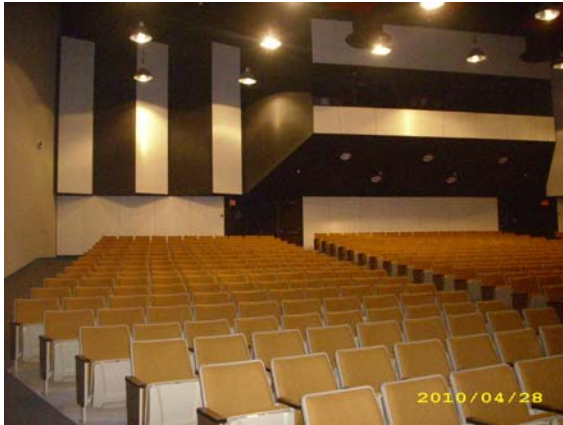
Auditorium Seats Before