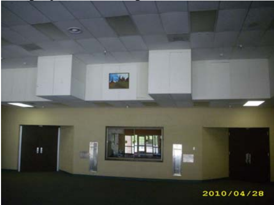
Lobby Before Picture

C. CDO Theater Updates: Construction is complete. This project was completed ahead of schedule and on budget.