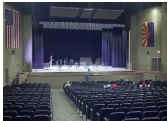
Stage After Picture

D. Nash Elementary Classroom Addition: Portable demolition will take place soon so site preparation and construction can start.