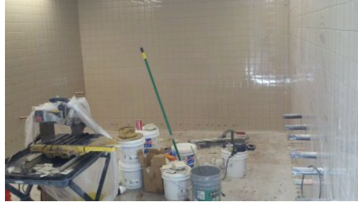
Tile Work in Restroom

B. Rillito Center Addition: Construction is 35% complete. CMU exterior walls are being completed. Steel roof joists and roof decking are being installed. Interior MPE is ongoing. This project is on schedule and on budget.