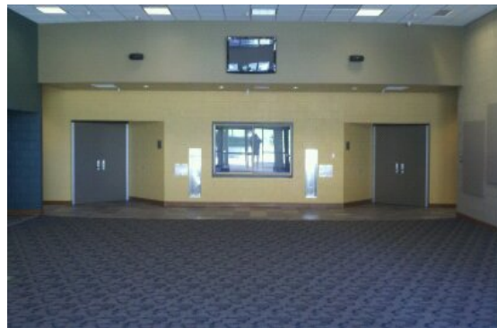
Lobby After Picture