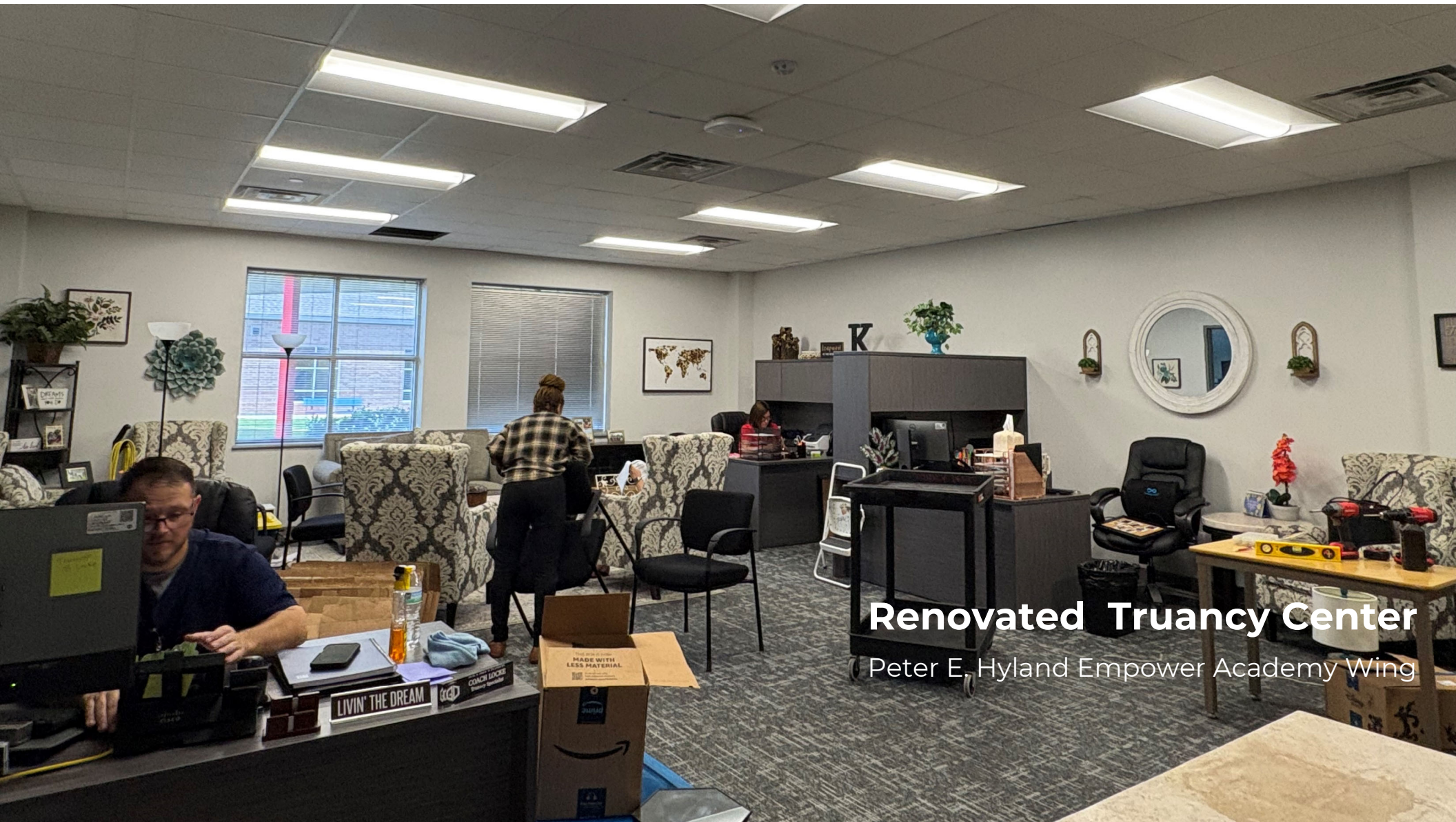
Renovated Truancy Center Peter E. Hyland Empower Academy Wing