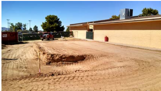
Weight Room Building Pad Prep

The Cross project is on schedule and on budget.