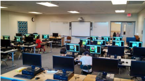
New Computer Lab Classroom