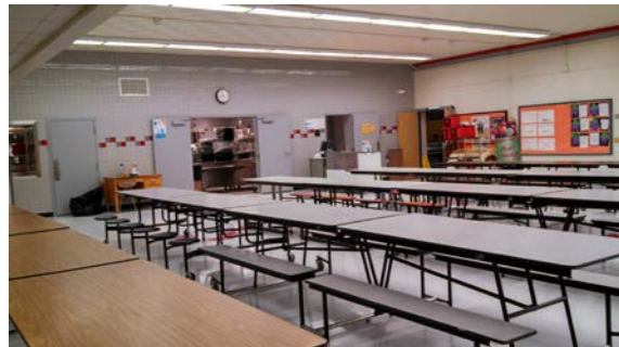
MPR Complete (new ceramic wall tile, new VCT floor tile, and repainted walls)