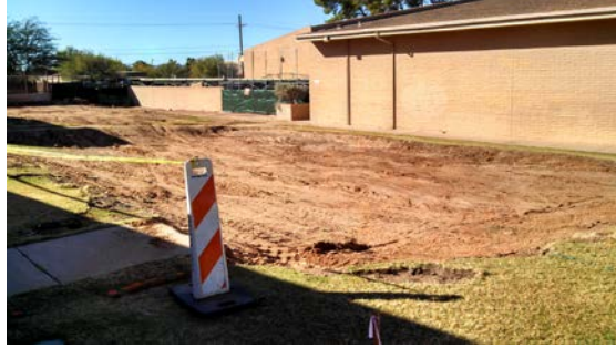
New Classroom Building Excavation

The Harelson project is on schedule and on budget.