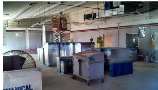
Overhead MP&E Rough-in

The building pad for the new weight room is complete. Excavation and footing installation is in process.