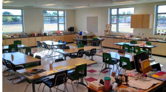
New Art Room