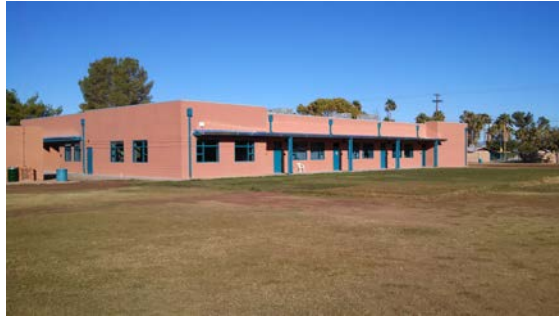
East Elevation – Facing Playground