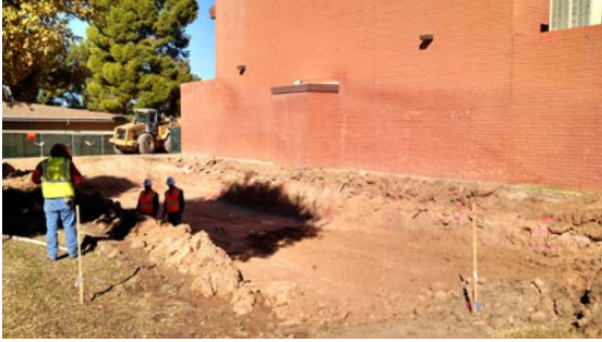
Music Room Excavation

Construction is 5% complete. Excavation and footing installation is in process for both the music room addition on the fun house as well as for the new classroom building.