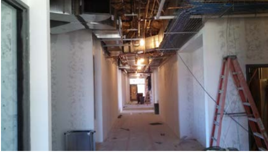
MP&E Above Ceiling Completion

New Classroom Building is in the finishes stages. Drywall is complete. Painting and interior finishes are in process.