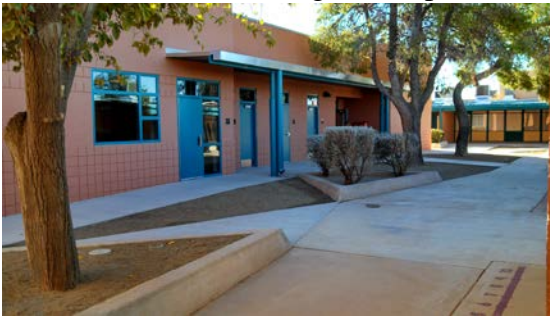
West Elevation – Main Entry