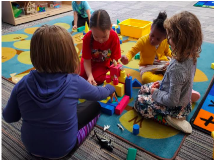
Engineers at Work