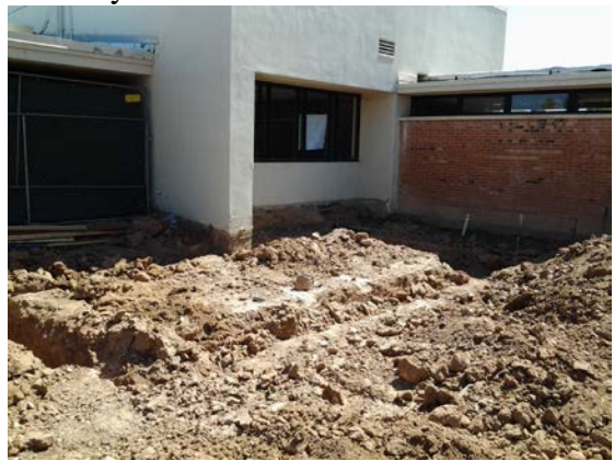
New Girls Restrooms at 100 Wing