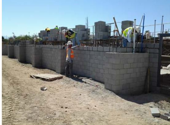
New PE Building Exterior Masonry