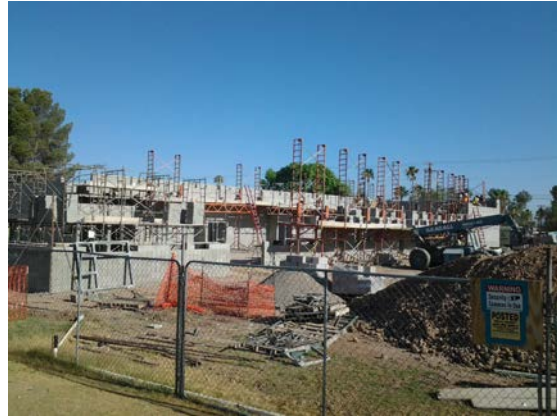
New Classroom Building Exterior Masonry Walls

Kitchen Renovation: Underground MP&E, concrete slab, interior framing and tile backer board are installed. Tile installation is in process. A new grease interceptor has been installed as well.