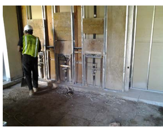
Existing Restroom Renovation