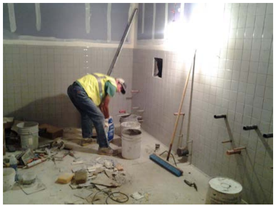
Panther Hall Restroom Tile Installation

Panther Hall Restrooms: Tile installation has started.