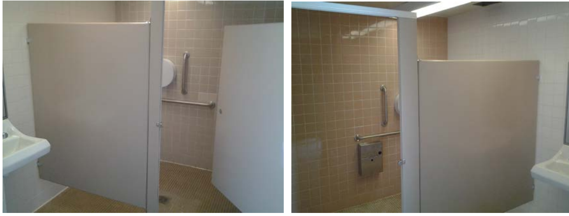
700 Wing Restrooms Completed for Summer School

700 Wing Restrooms: Renovation complete and in use for summer school.