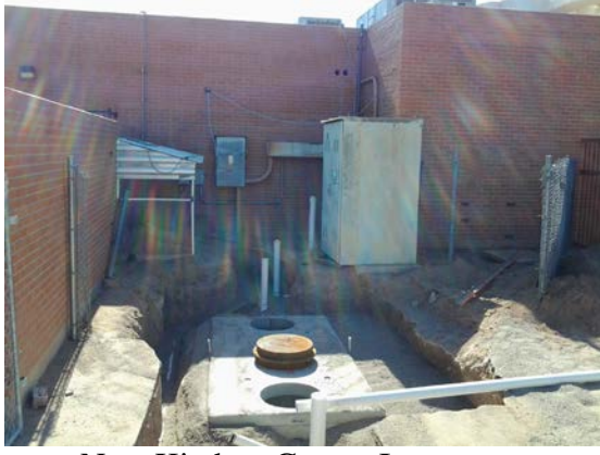
New Kitchen Grease Interceptor

Library: Demo is complete and a new middle school computer lab has been constructed in the south east corner of the library. Repairs, including new HVAC are in process.