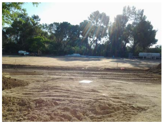
New Classroom Building Pad

Admin Renovation: Wall framing and vertical structural steel for the addition are complete. Interior repairs are in process.