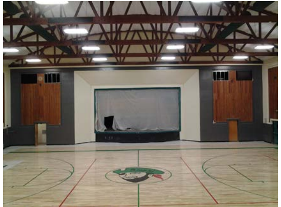
Renovated Gym Facing Stage

Gym Renovation: Interior finishes are being completed.