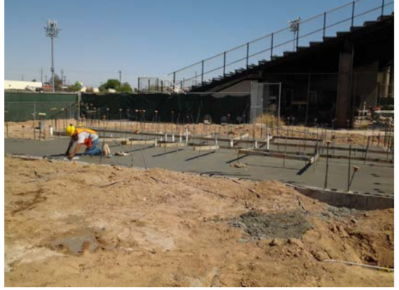
New PE Bldg Mechanical Installation