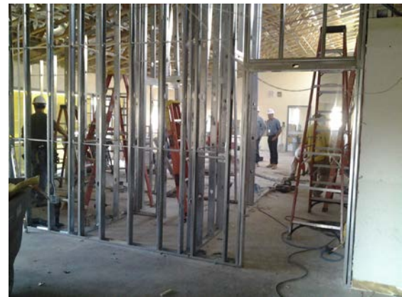
Admin Interior Framing and MP&E

The Rio Vista project is on schedule and on budget.