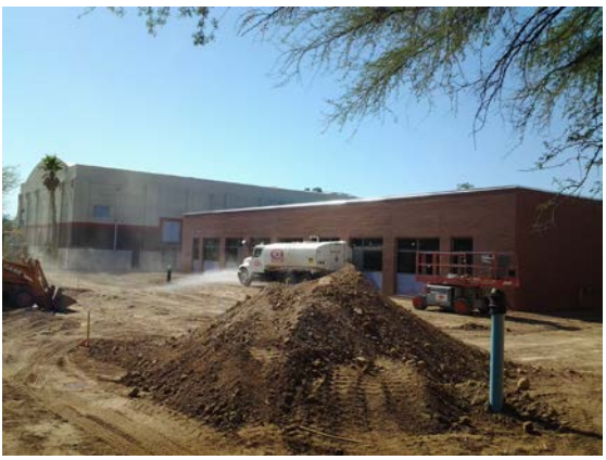
Rear view of New Classroom Building

Gym Renovation: Interior finishes are being completed.