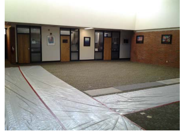
Administration Building Paint and Millwork Renovation