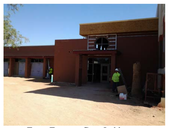
Front Entry to Gym Lobby