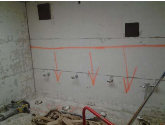
PAC Restroom Demolition

Student Restrooms: Student restrooms in the 100, 200, 300, and 400 wings are in various stages of demo and repair. The two boys restrooms in 100 and 300 are being renovated while the two girls restrooms in 200 and 400 are being converted to staff restrooms, and two new girls restrooms are being constructed in the 100 and 300 wings