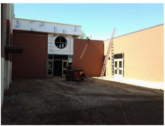
Rear Entry to Gym Lobby

Locker Room Renovation: Interior masonry walls are complete. Locker and fixture installation is in process.