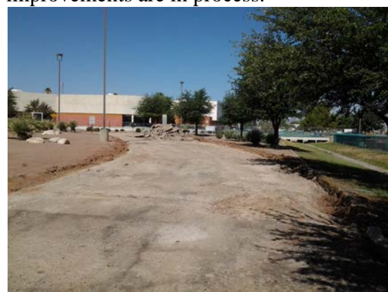
Student Drop Off Improvements

Administration Renovation: Demo of the main reception area is complete and paint and new millwork installation is in process.