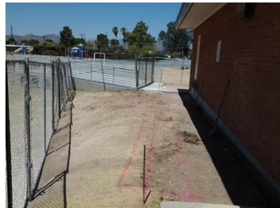
Library Office Layout for New ADA Ramp to Comp Lab The Nash Library project is on schedule and on budget.