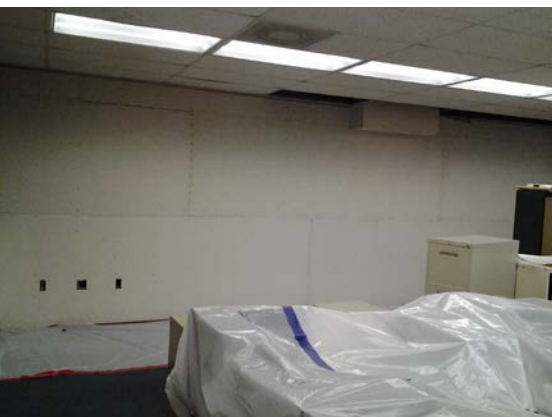
New Classroom Walls Framing, Infrastructure, and Drywall

The AMS project is on schedule and on budget.