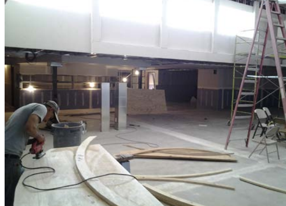
Library Drywall and Millwork Installation