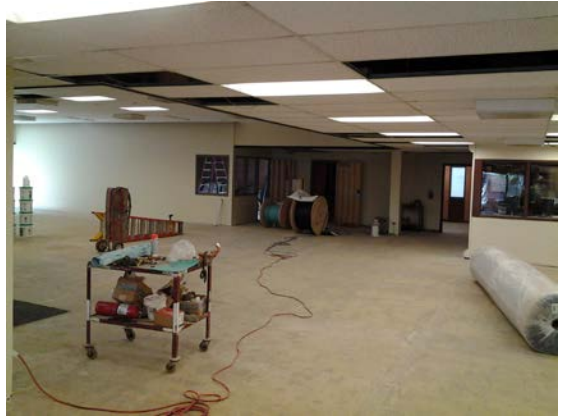
New Computer Lab in Library

Library: Demo is complete and a new middle school computer lab has been constructed in the south east corner of the library. Repairs, including new HVAC are in process.