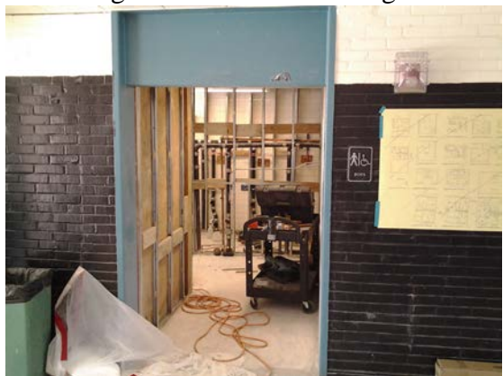
Boys Restroom Renovation

Student Restrooms: Student restrooms in the 100, 200, 300, and 400 wings are in various stages of demo and repair. The two boys restrooms in 100 and 300 are being renovated while the two girls restrooms in 200 and 400 are being converted to staff restrooms, and two new girls restrooms are being constructed in the 100 and 300 wings