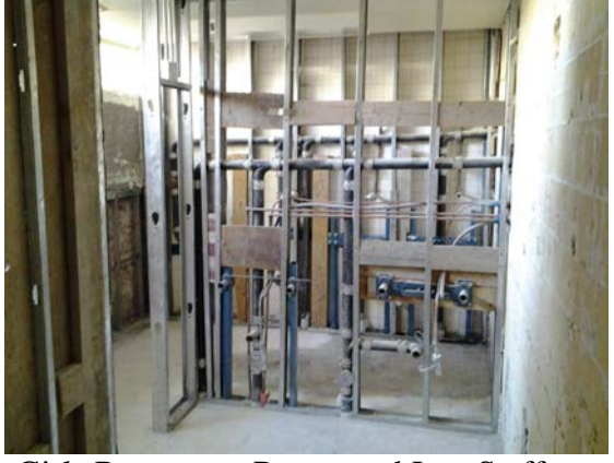
Girls Restrooms Renovated Into Staff