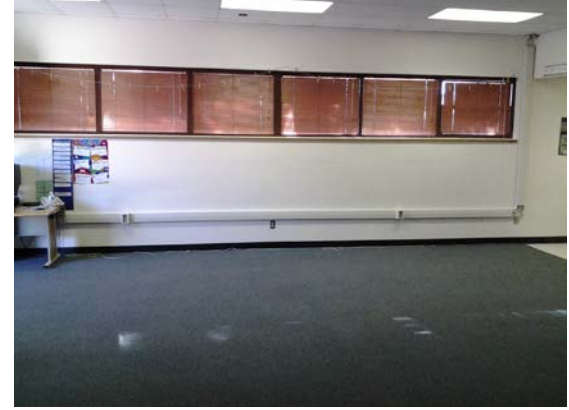
New IT Cabling Pathways on Walkways