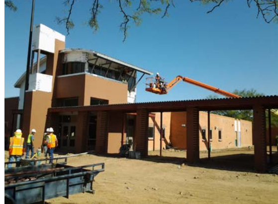
Front View of Administration