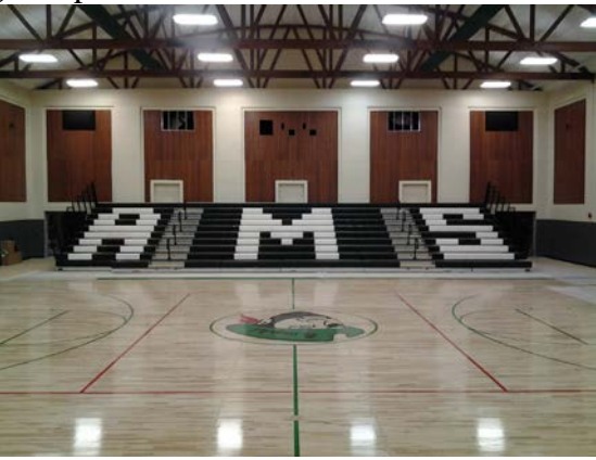
Renovated Gym Facing Bleachers