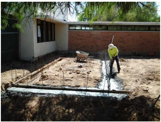
New Girls Restroom at 300 Wing