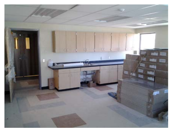
New Health Office

New Classroom Building: Interior and Exterior finishes are in process.