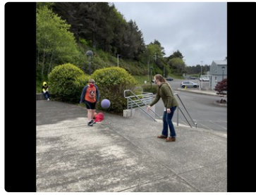
One-on-one with a teacher!