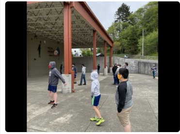
Practicing safety protocols - mask wearing and physical distancing!