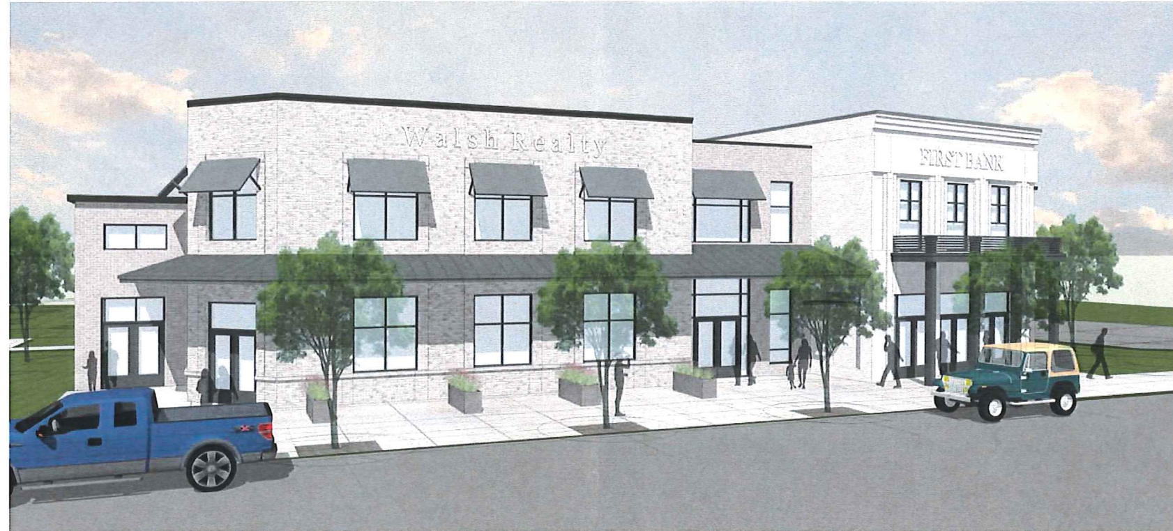
Exterior View 01