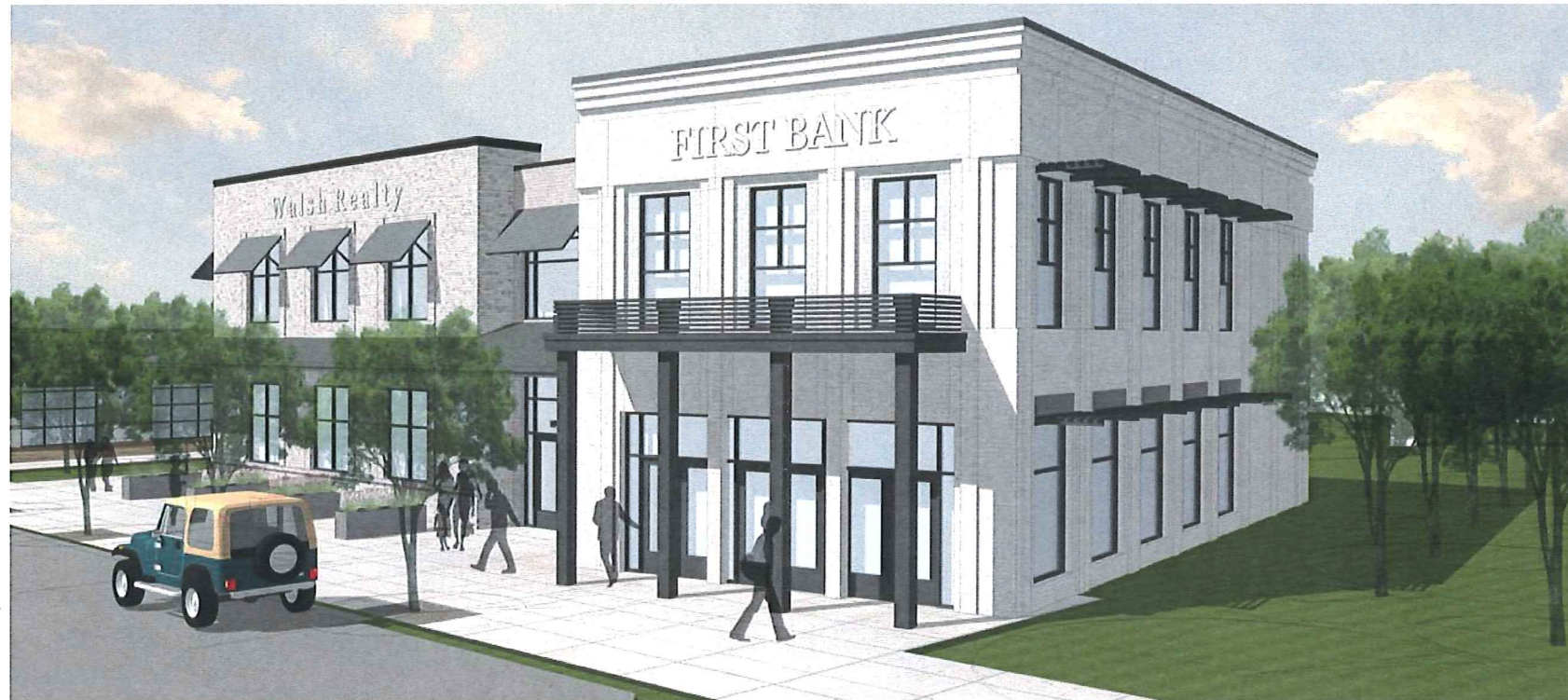
Exterior View 02

These documents may not be used for regulatory approval, permit, or construction.