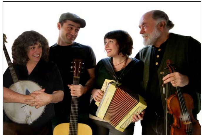
The Family Carr plays across the United States and around the world.

World class music was provided by Family Carr and a silent auction featured art from several local artists.