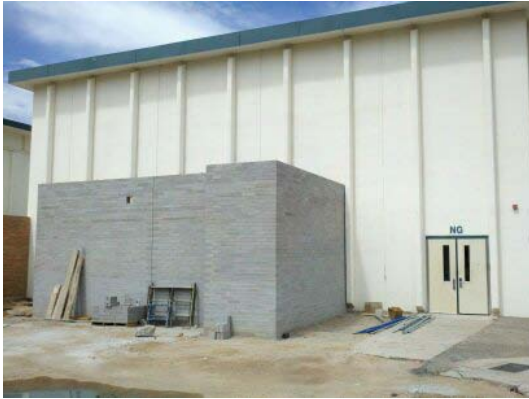
New North Gym Restrooms