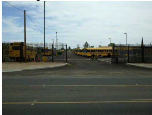
North Bus Yard (exit at Roger Rd.)