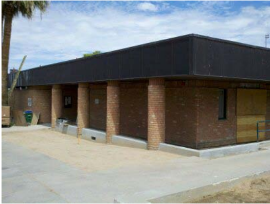
Administration Exterior – Storm Water Drainage Improvements