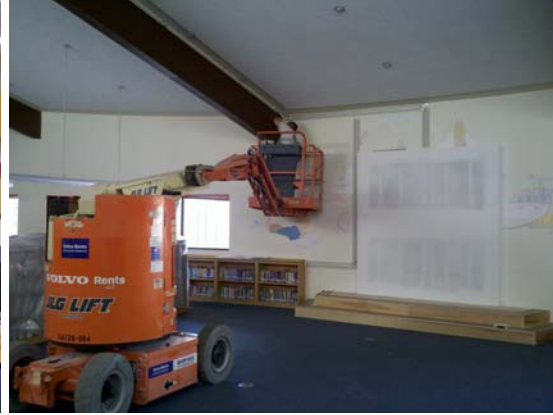
Library Smart Board Prep and Re-Cabling