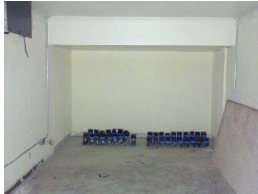
New MDF Interior Prior to Equipment Installation