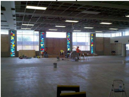
MPR South Elevation