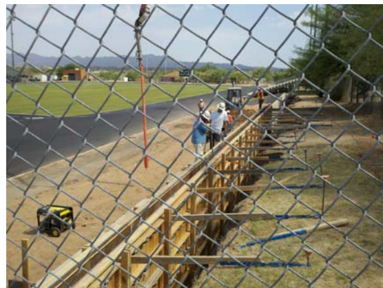
Long Jump Runway Preparation