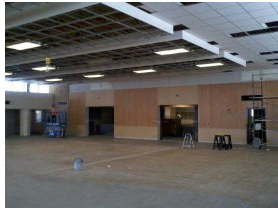
MPR North Elevation