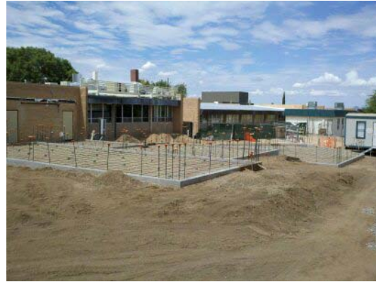
C Bldg Addition – Underground and Stem Walls