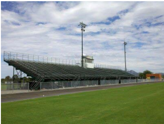
Re-Painted Bleachers and Light Poles

The stadium repair project is on schedule and on budget.