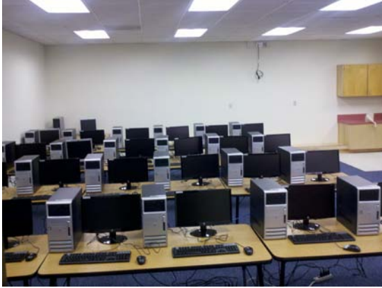
New Computer Lab

Copper Creek re-cabling project was completed on schedule and on budget.