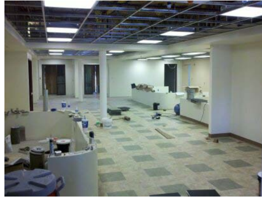
Administration Interior Finish Application