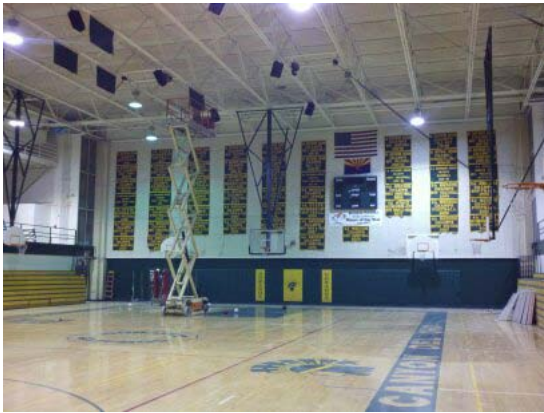
South Gym Repainted