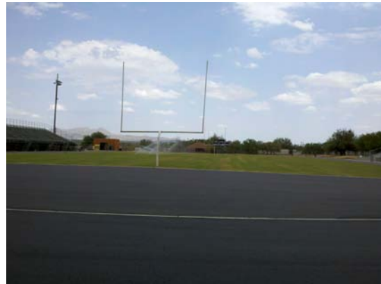
New Sod and Asphalt