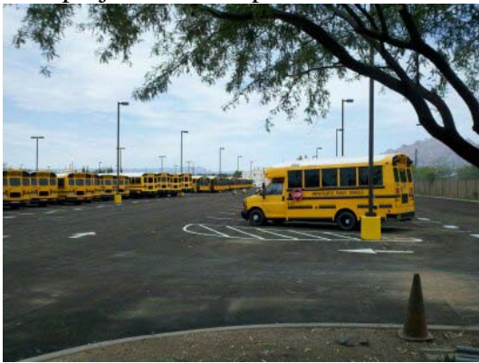
South Bus Yard (from Pastime Rd)

This project was completed on schedule and on budget.