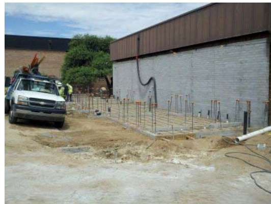
New J-3 Student Restrooms