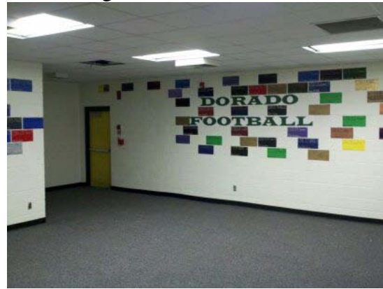
Team Rooms & Locker Rooms Renovated