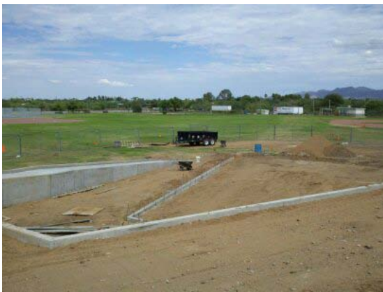
Shot Put Venue Preparation