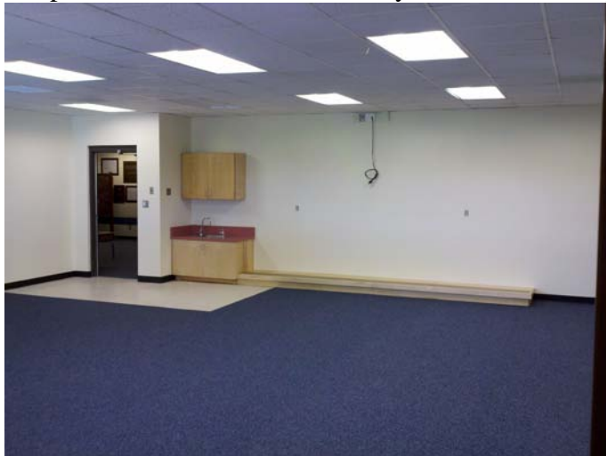
Typical Re-cabled Classroom with Accordion Wall Replaced

Schematic design is complete and Design Development drawings have been started.