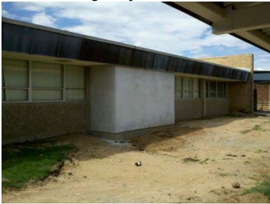
New MDF on North Elevation of F Bldg