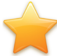
Bookmark the BSD website for banner information