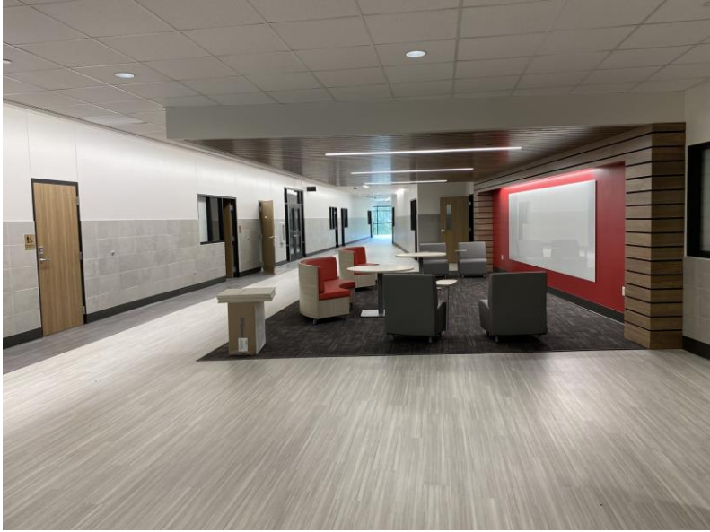
Collaboration Space in Area 10