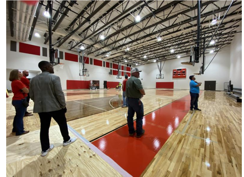
Board Member Tour