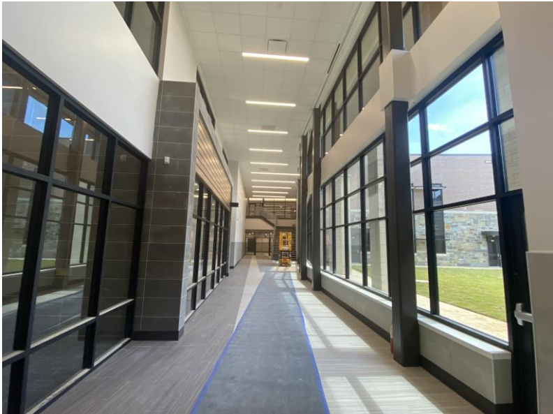
Corridor in Area 3