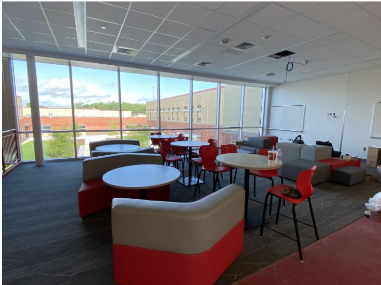
Flex Area 1 on 2 nd Level