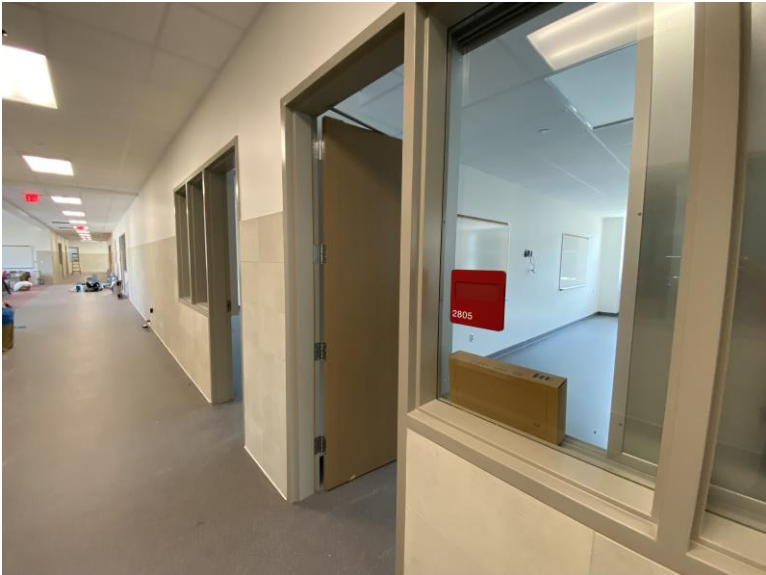
Signage on 2 nd Level