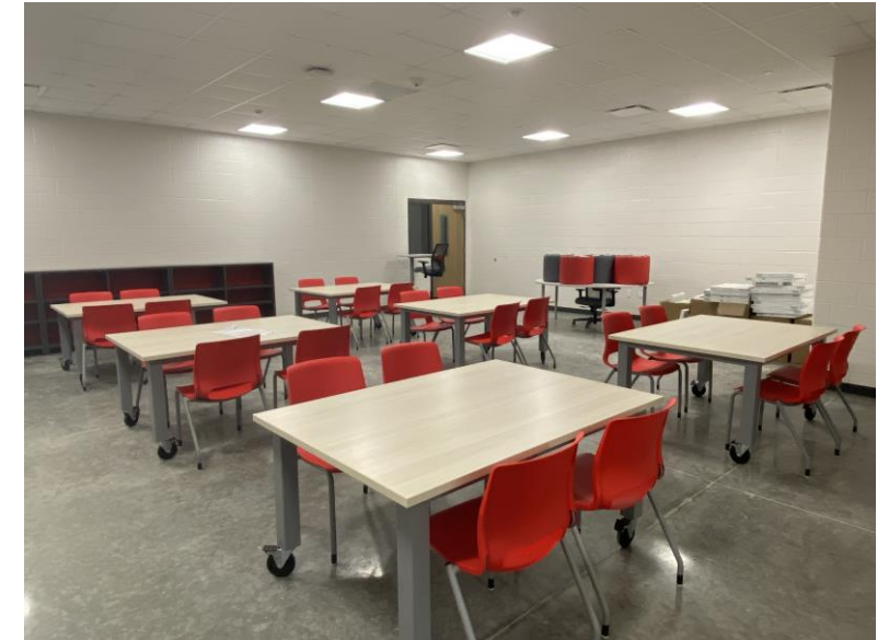
CTE Classroom in Area 3