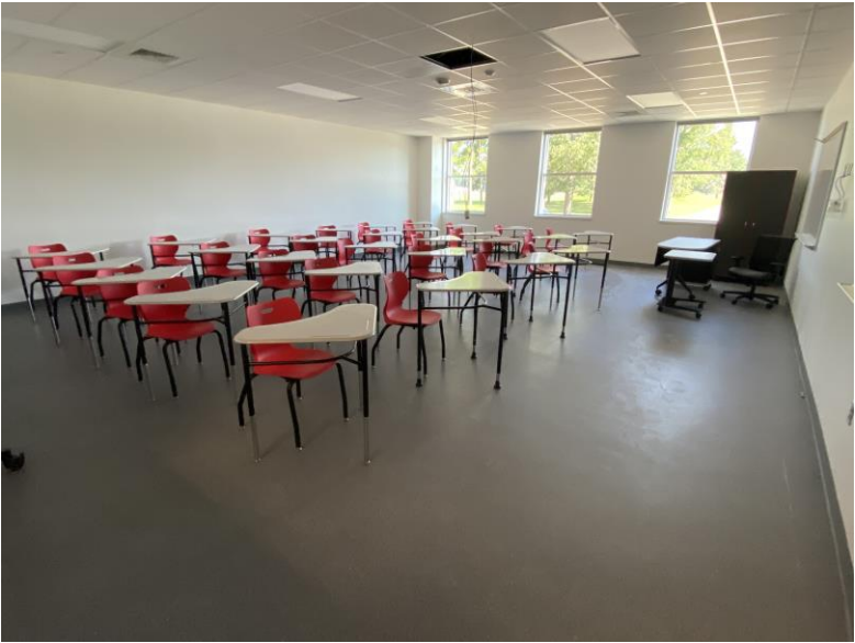
Classroom on 1 st Level Room