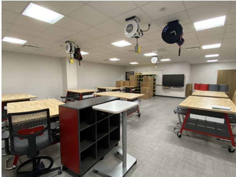
Robotics Classroom in Area 3