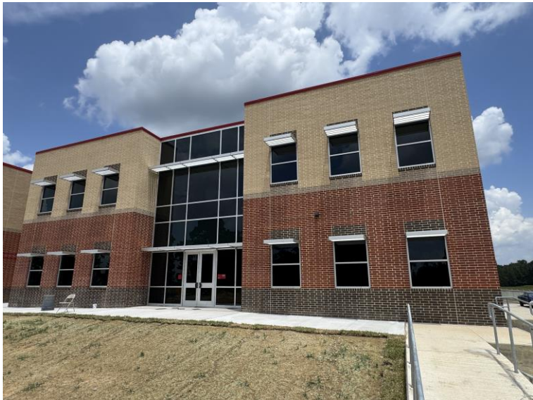
Exterior on the South Side