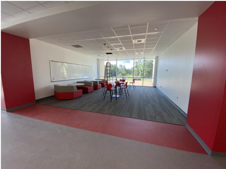
Flex Area 2 on 2 nd Level