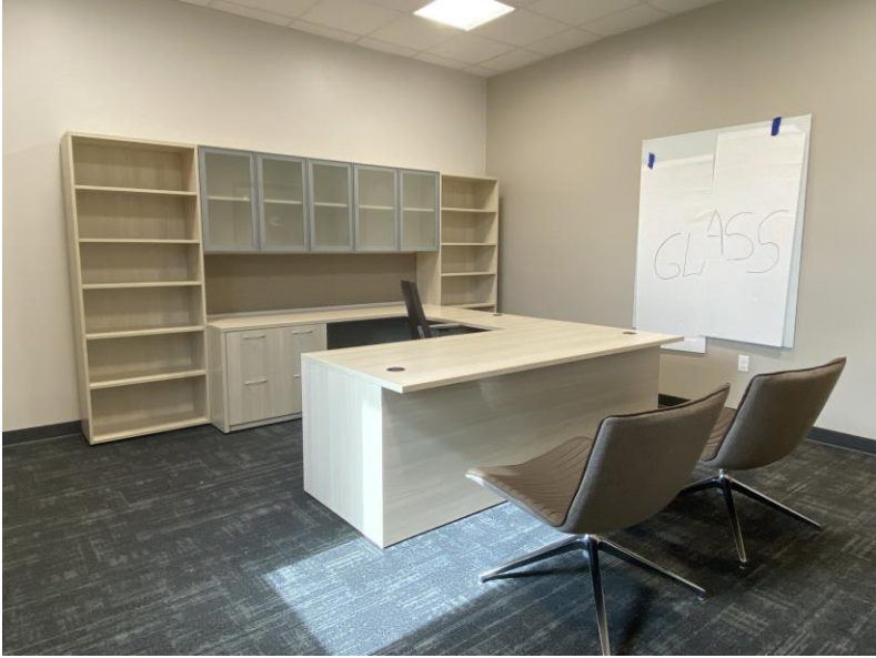
Principal's Office in Area 2