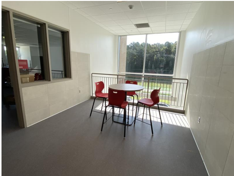
Café Tables on 2 nd Level