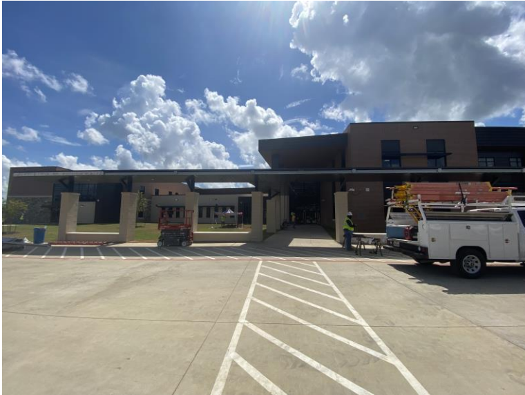
Exterior at Main Entrance