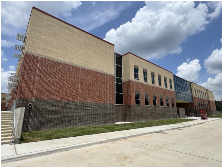
Exterior on the East Side