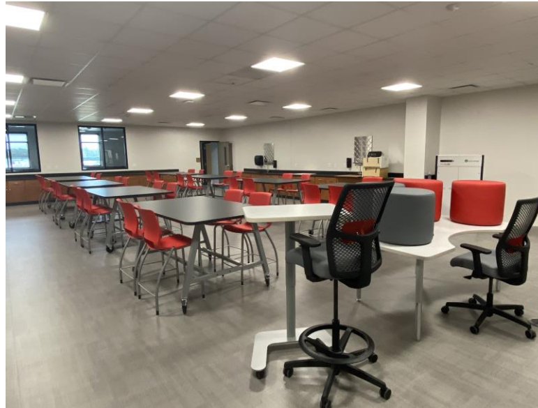
Science Lab in Area 10