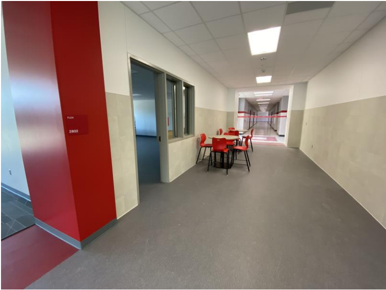
Corridor with Café Tables on 1 st Level