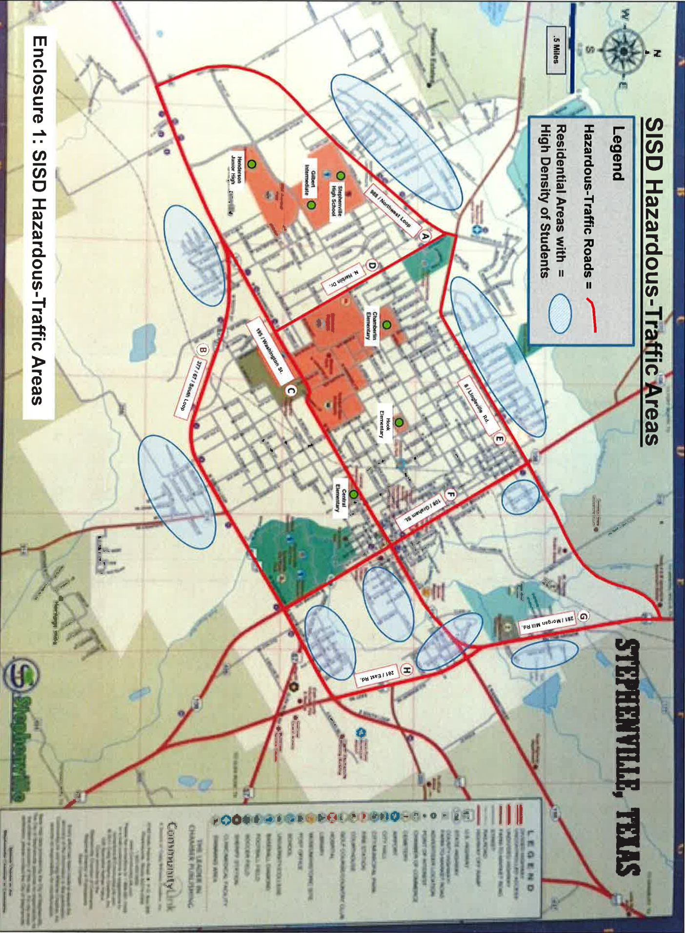
Enclosure 1: SISD Hazardous-Traffic Areas