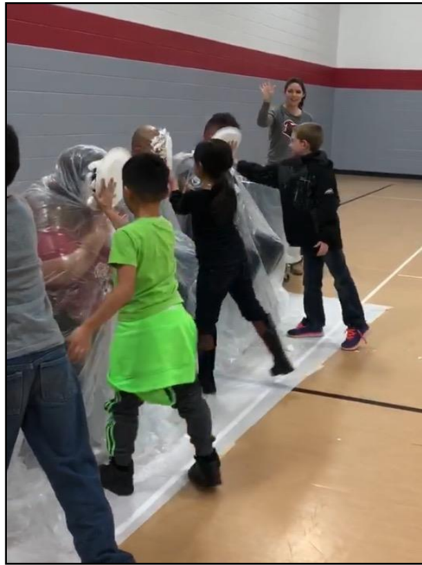
PTO FALL FESTIVAL: The PTO held their best Fall Festival ever this year. There were games for all ages, great prizes, a hot dog or nacho dinner, a “sweets” shoppe, and an exciting raffle table filled with amazing items. The PTO made over $13,400 this year!