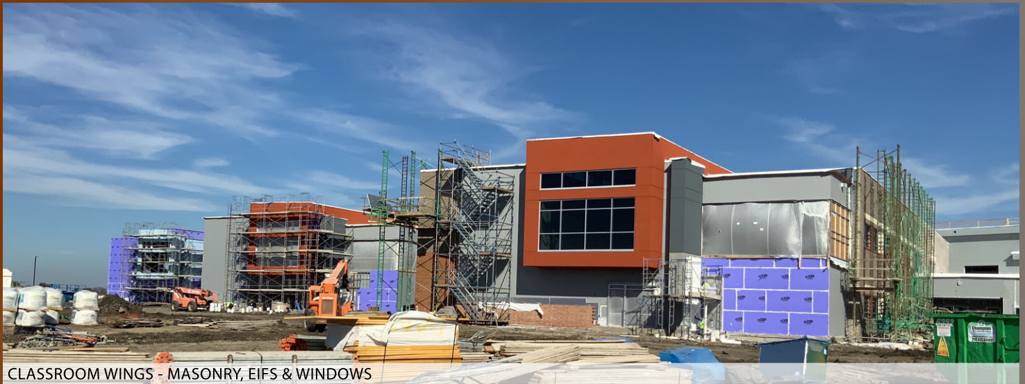
CLASSROOM WINGS - MASONRY, EIFS & WINDOWS