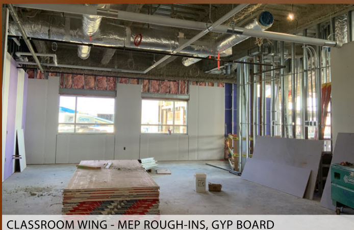
CLASSROOM WING - MEP ROUGH-INS, GYP BOARD