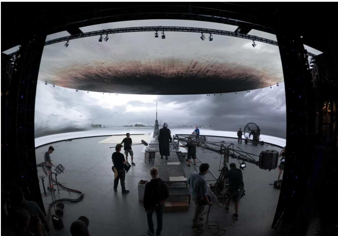
Figure 2 - Looking inside Digital Volume for Season 1 - The Mandalorian (LucasArts)