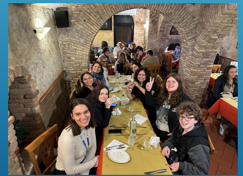
Dinner in Rome