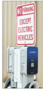
North Little Rock opened four electric vehicle charging stations at the Rock Region Trolley Barn, 2110 Bishop Lindsey Ave. They are free to use.