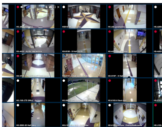
High School Cameras