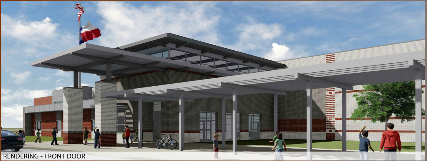
RENDERING - FRONT DOOR