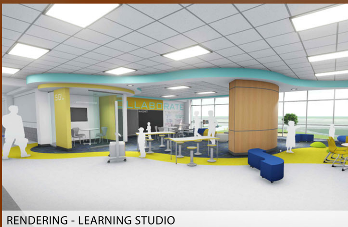
RENDERING - LEARNING STUDIO