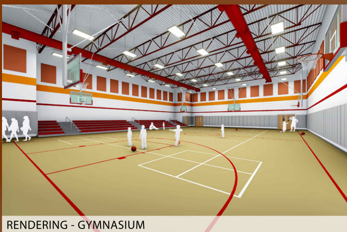
RENDERING - GYMNASIUM