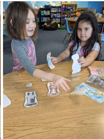
Our Kinders are learning so much