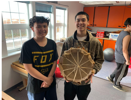
Tying it around a hoop was difficult but worth it.