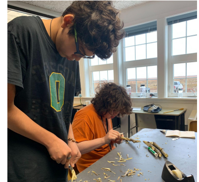
We even made drum sticks out of alders and leather.