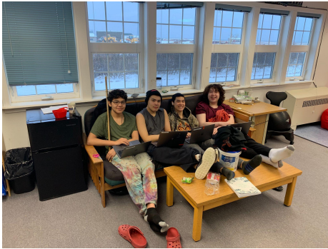
The kids are working hard and having fun.