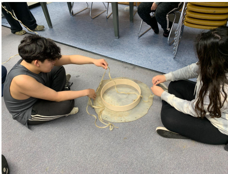
The students had a great time making drums. Soaking it for flexibility.