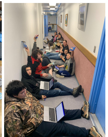
We got to learn and have snack in the hallway