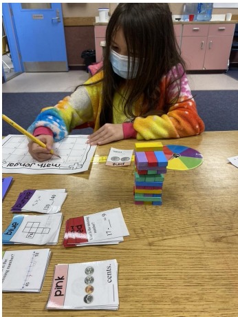
More Amazing math Games!