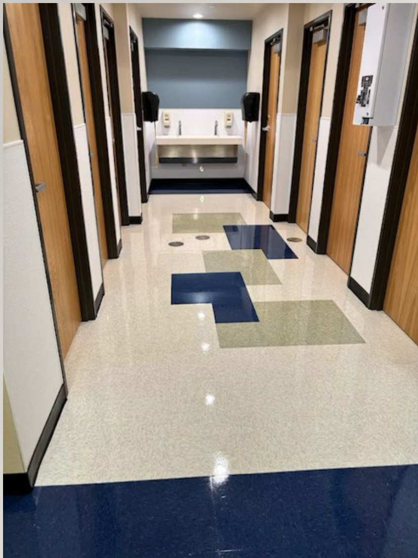
Taft Elementary new bathrooms