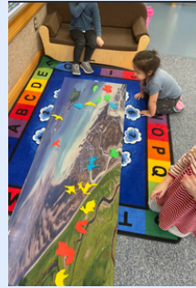
Land, Water, or Air