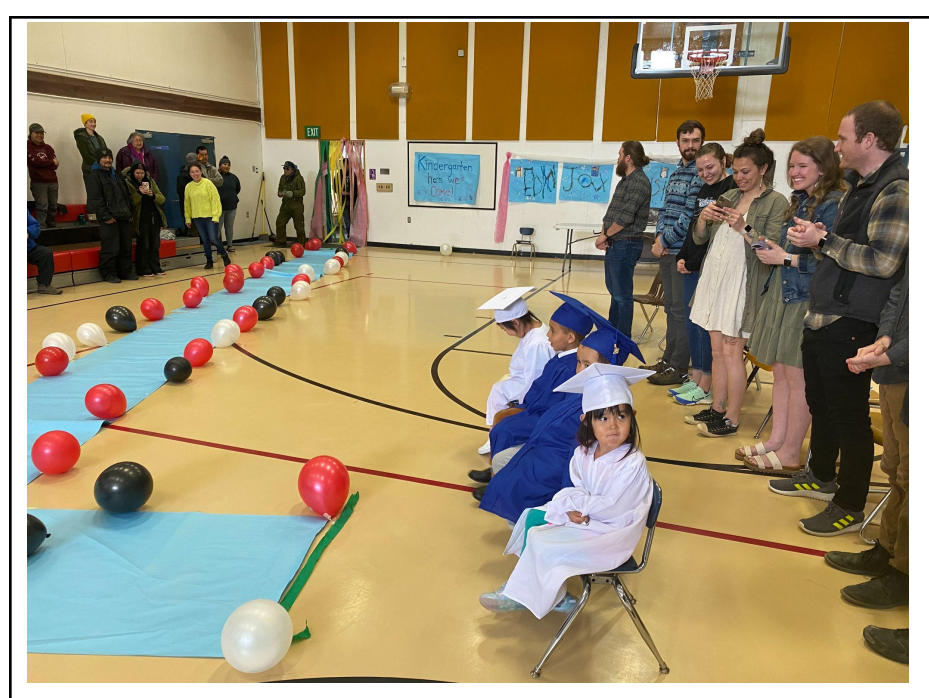
Our preschool graduation. Four to join the ranks of kindergartners next year.