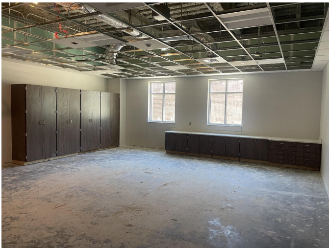
Casework in area C