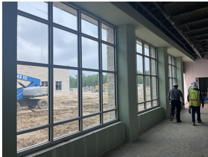
Storefront in area E