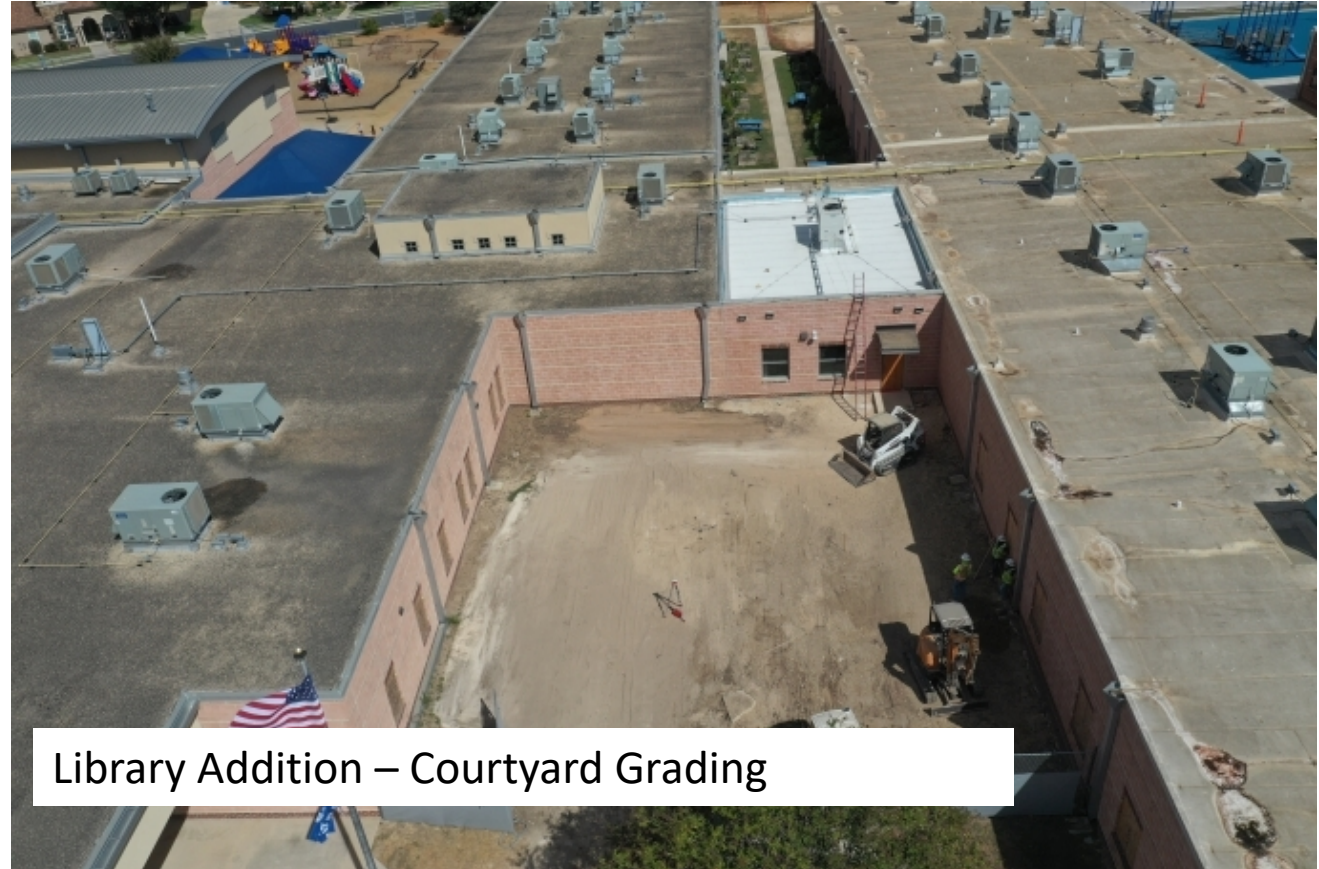
Library Addition – Courtyard Grading