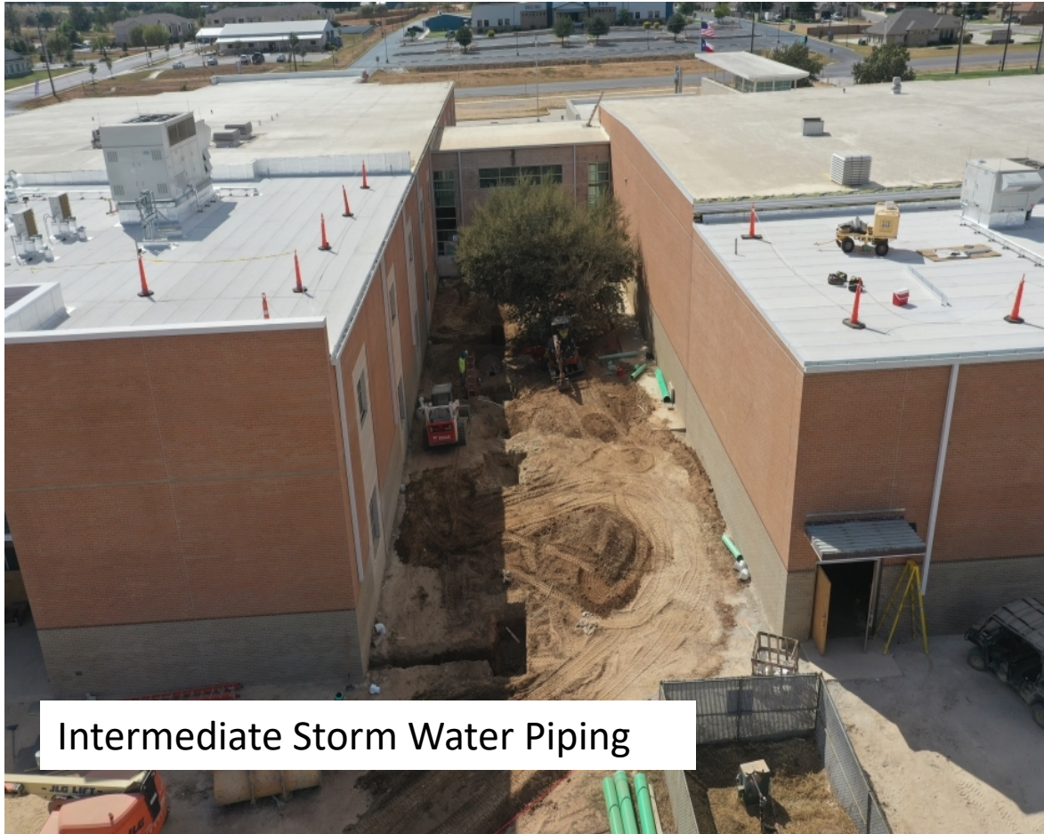
Intermediate Storm Water Piping

Week of October 17 th – Intermediate School