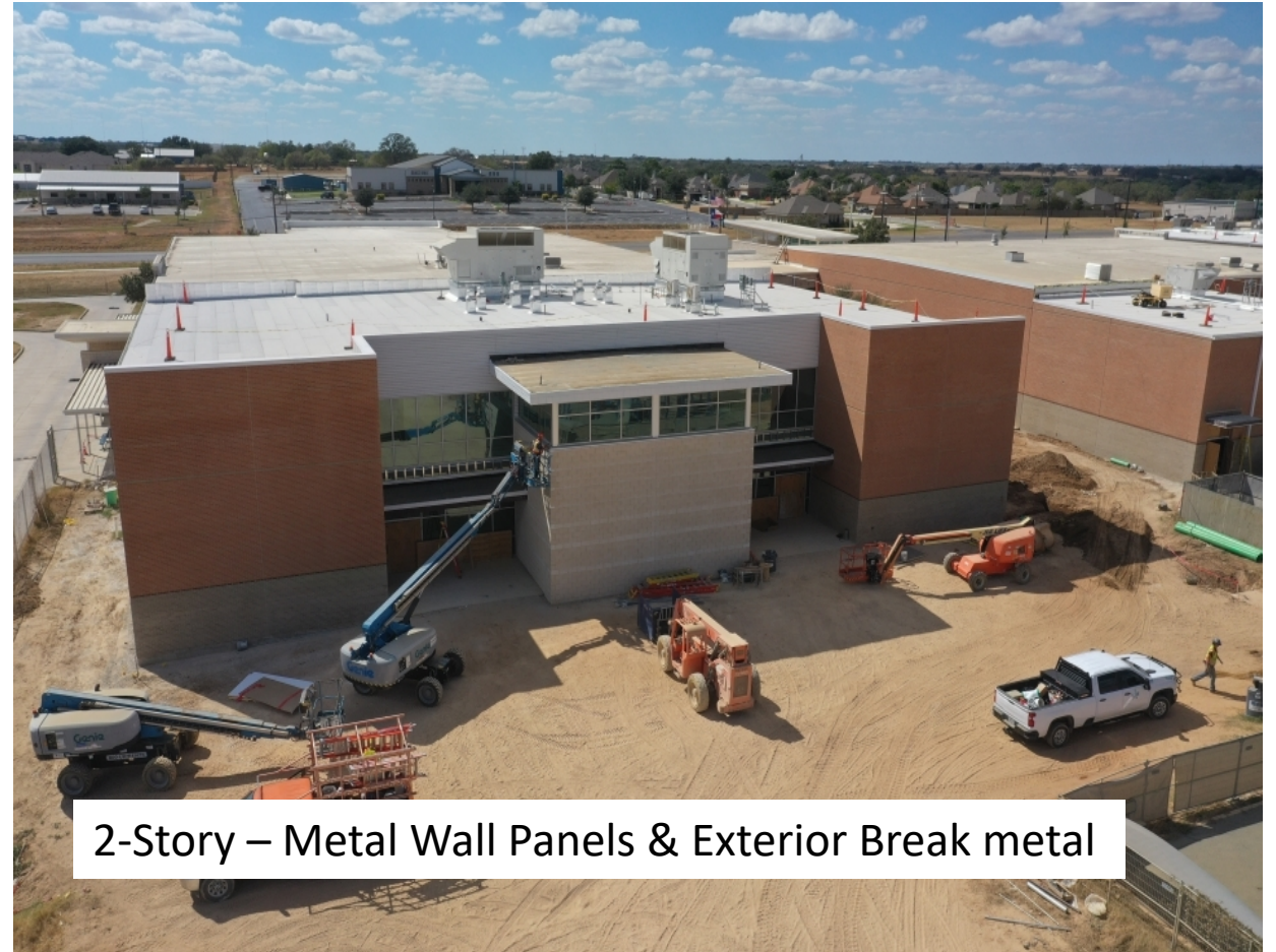
2-Story – Metal Wall Panels & Exterior Break metal