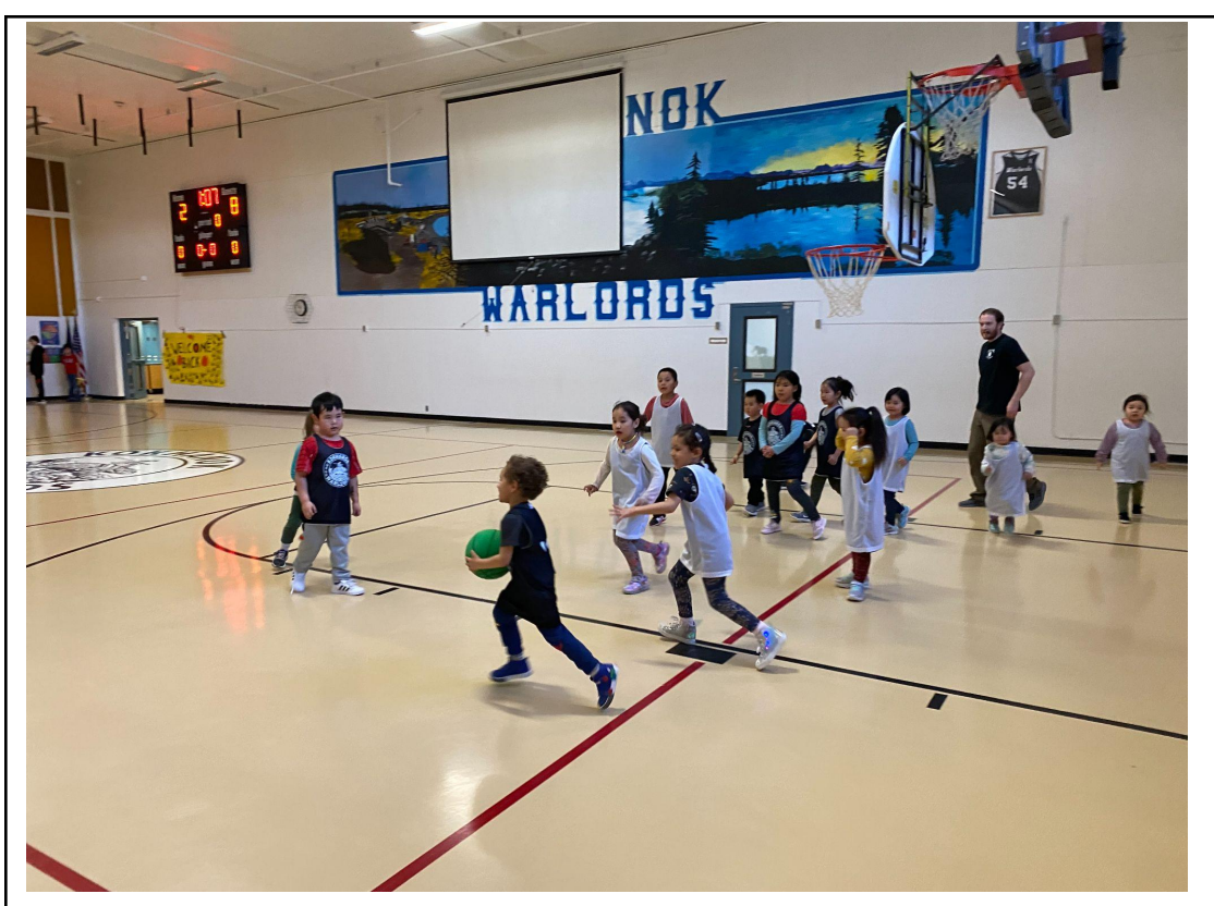
Apparently, dribbling is optional ...