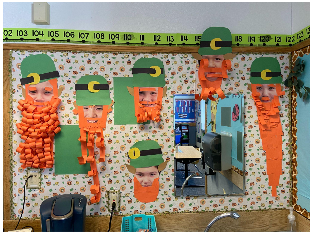
Saint Patrick's Day celebrations