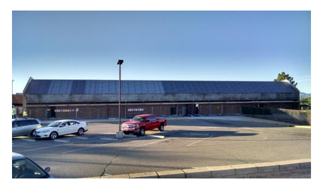
North Face of New Building

The Mesa Verde project is on schedule and on budget.