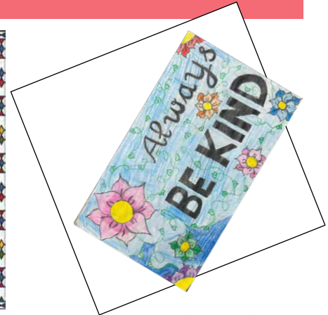
Strategic Plan Update