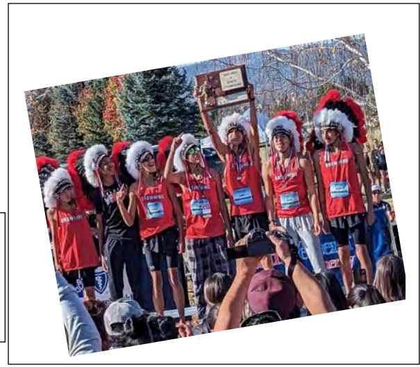
2023 State Class A Cross Country Champs!!!

Next parent meeting scheduled for November 9, 2023 at noon at the administration building.